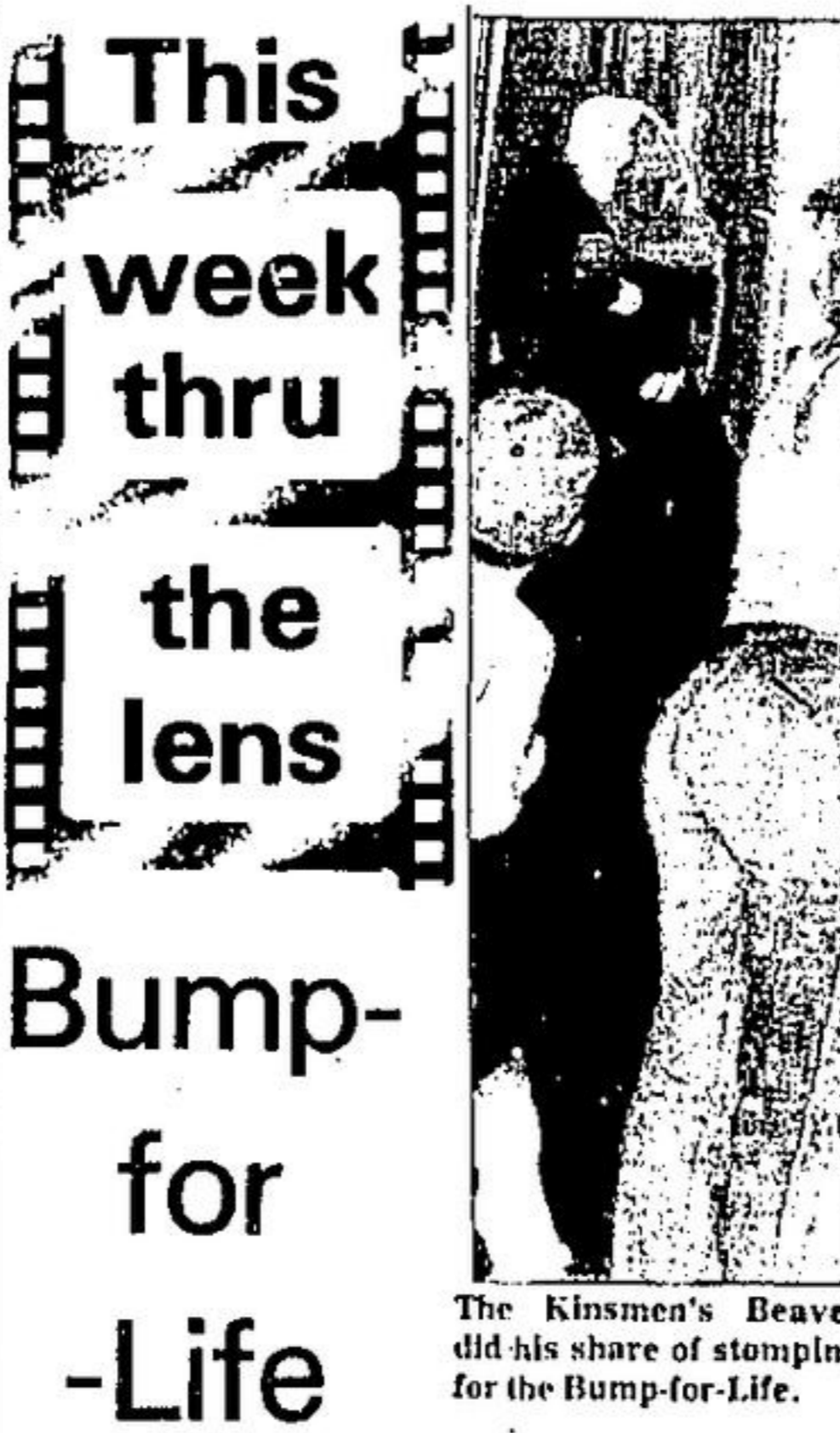
The Kinsmen's Beaver did his share of stomping for the Bump-for-Life.