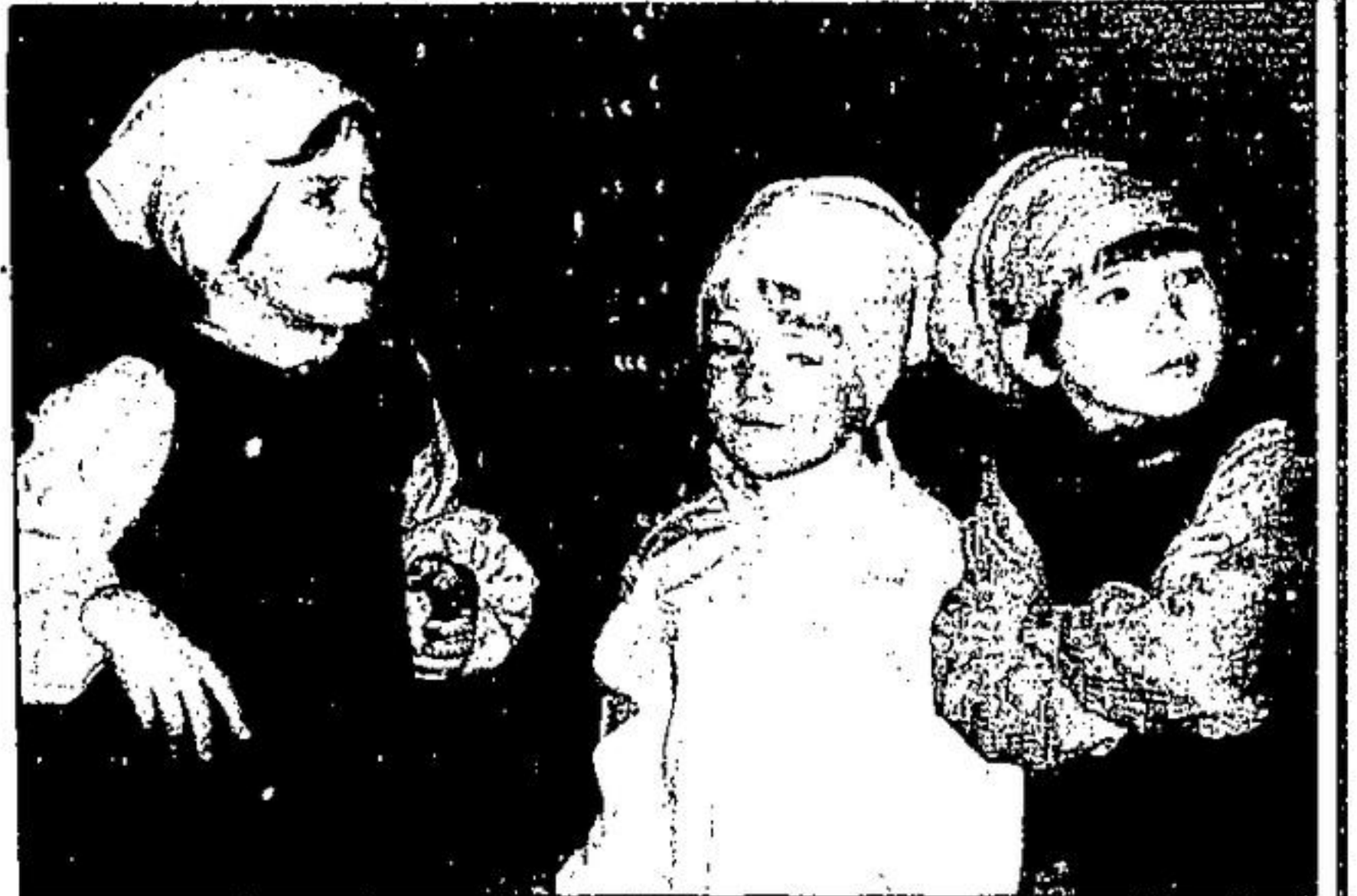
Three dwarfs out of seven consult one another about Snow White in the preschooler's Disney on Parade number. They dressed up as various Disney characters for their part in the junior production.