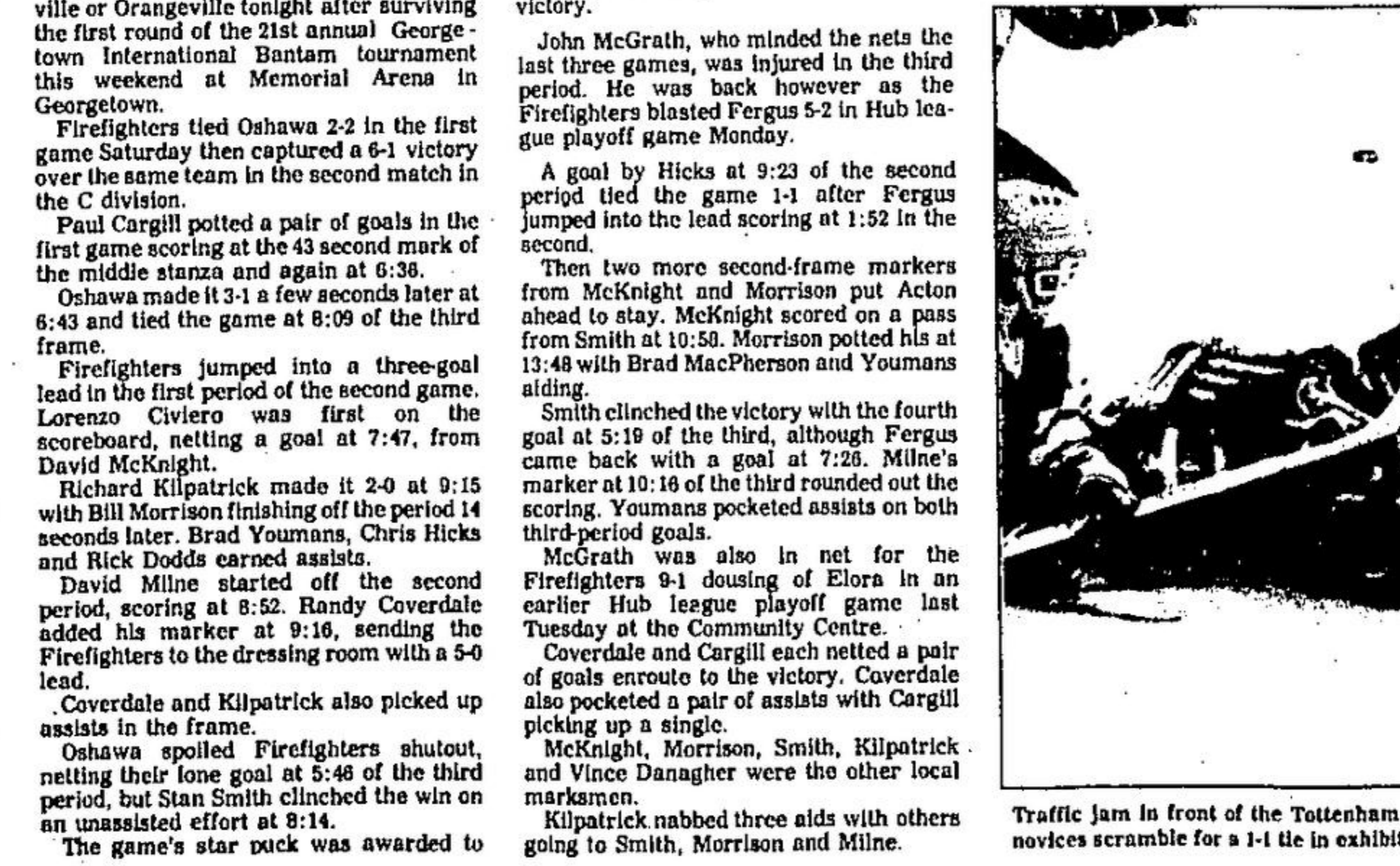
Traffic jam in front of the Tottenham net as the Acton Concrete novices scramble for a 1-1 tie in exhibition action, Saturday at the Community Centre. See inside for game details.

Laing Construction major atoms kick off the seventh annual Centennial Atom tournament Friday with the first game of the three-day event at the Community Centre. Laing plays Galt at 6:30 p.m. Friday night in the first game. They will play again at 1:15 p.m. Saturday if they win Friday night or 12:10 if they lose. There are several new teams entered in this year's tournament, including Burlington, Fergus, Tillsonburg, Niagara-on-the-Lake, Sandwich West and Kanata. Last year's champions, Stouffville, are returning as well as Saltfleet, the consolation winners. Unionville, Galt, Beamsville, Kitchener, Oshawa and Goderich are also returning. The consolation game gets underway Sunday at 1:30 p.m. with the tournament title up for grabs at 2:40 p.m. also on Sunday. Laing has had a successful year. They are in the finals of the OMHA playoffs and are doing equally well in Hub league playoffs. This year several local companies are sponsoring the tournament. Laing's, Denny's Insurance, Petty's Garage, Acton Terminal Warehouse, Canadian Tire, J & T Sports, A & B Foodland, Family Restaurant, Acton IGA, Robertson's Flower Shop, the Olde Hide House, Family Barber Shop, Jug City, Lakeview Centre, Alec Johnson Real Estate, Bank of Nova Scotia, Thompson Fuels, Goy Cartage, Acton Hockey Moms and Larry's House of Buys. For a complete tournament schedule see Scoreboard.