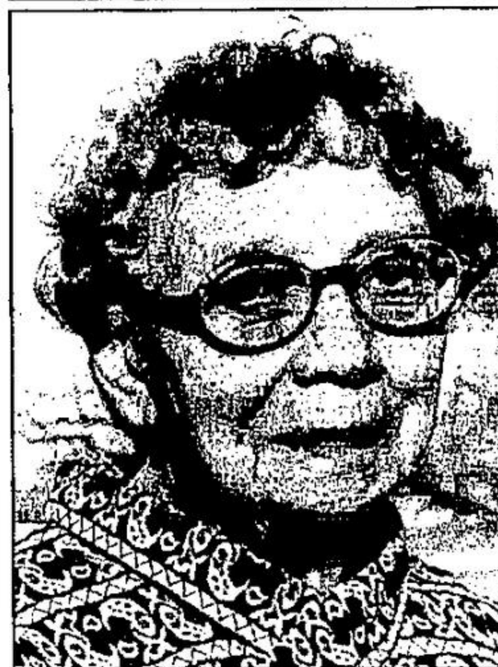
96 years young