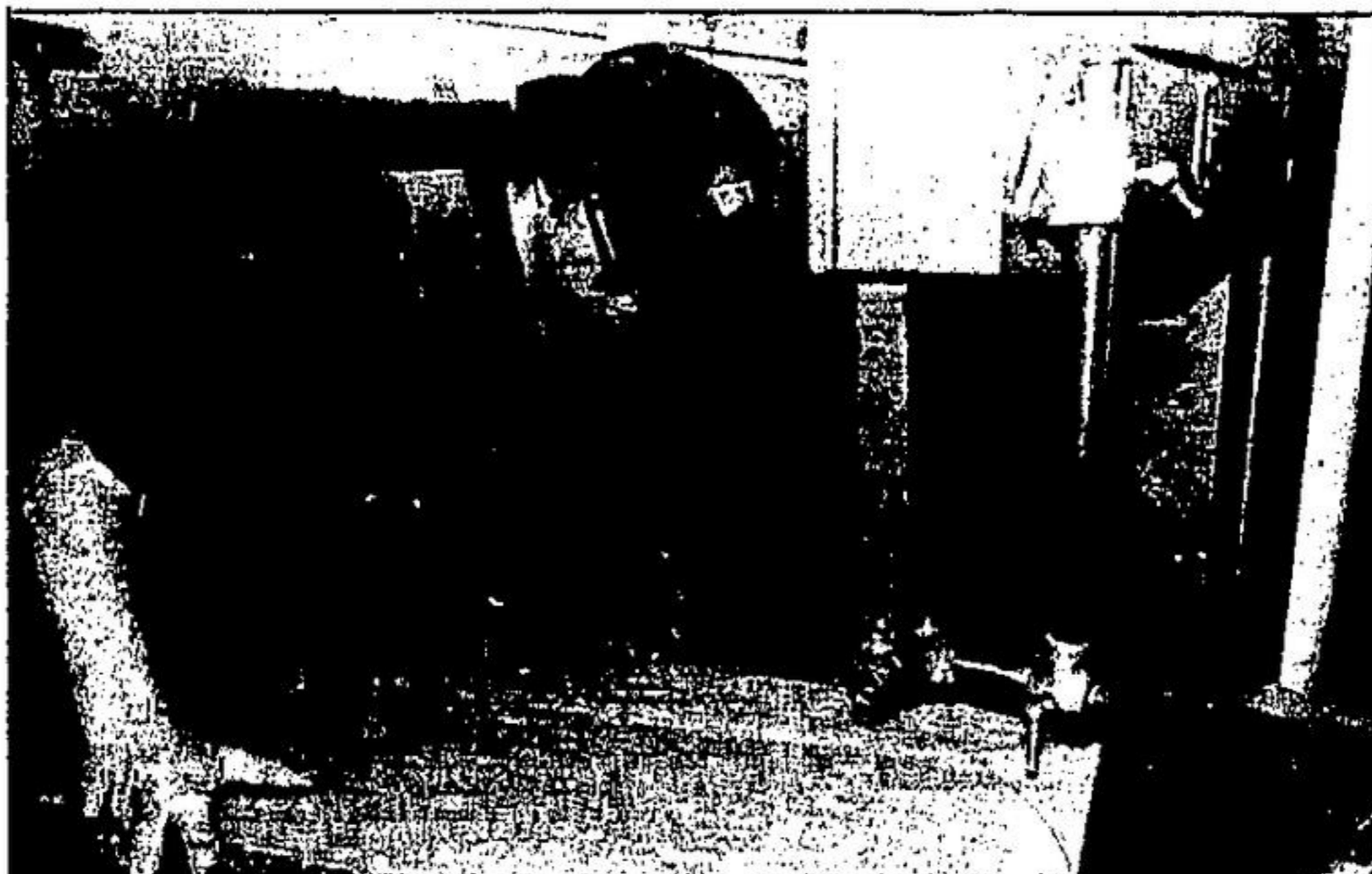
Going in circles can be fun as Ron Kirkwood discovers with the hand saw.