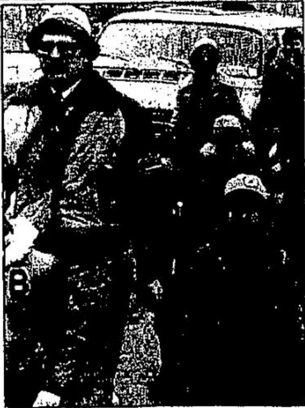
Beavers marched in Sunday's parade.