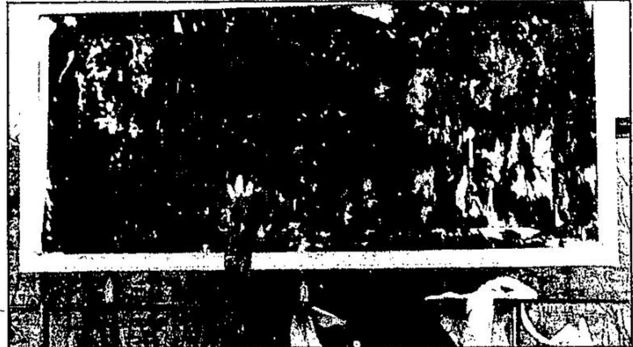
This billboard promoting shopping in downtown Georgetown was torn down Friday morning.