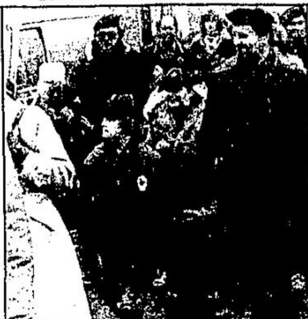
Acton cubs turned out in large numbers for Sunday's annual church parade.