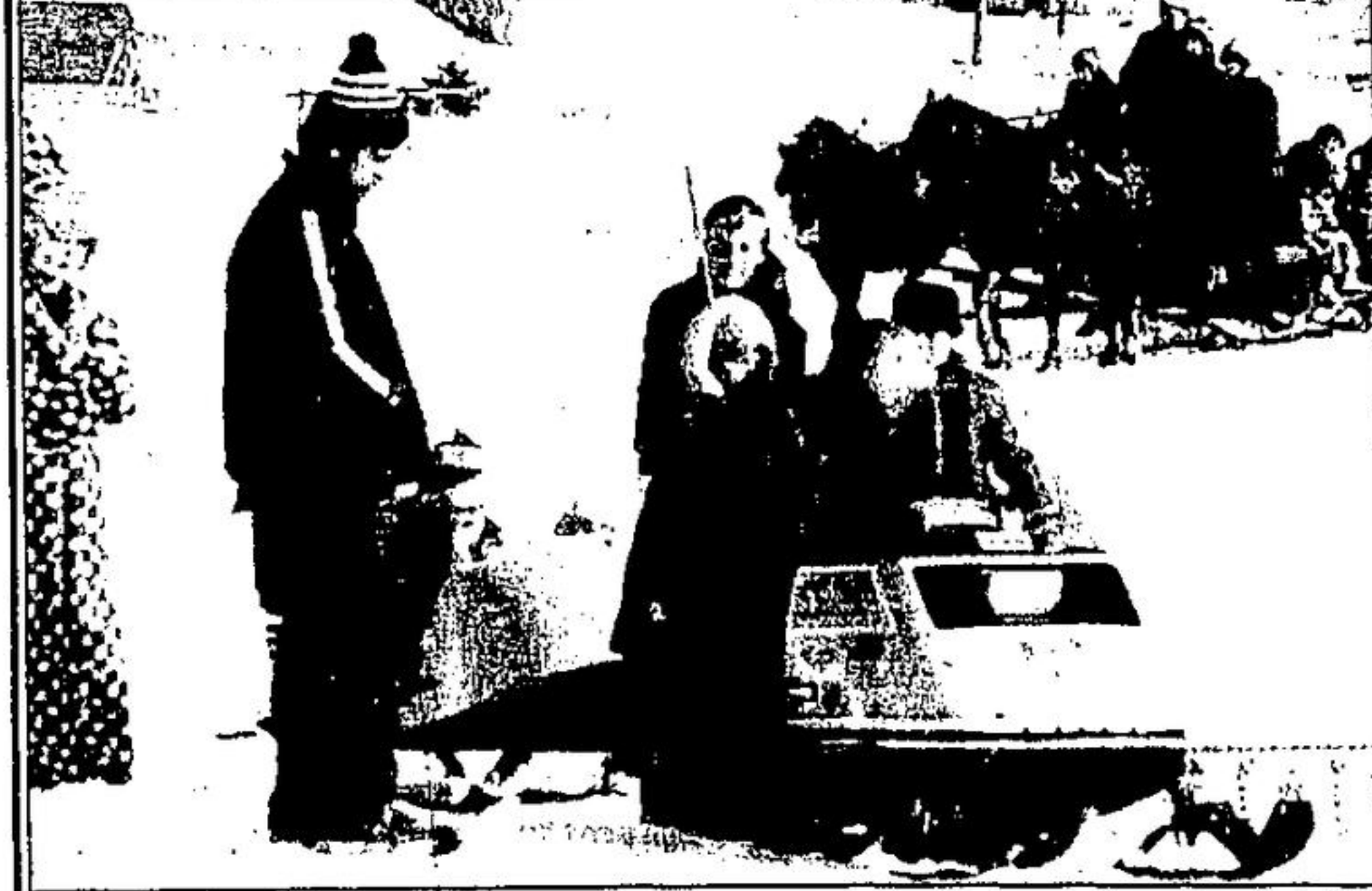
Fine weather graced the Acton Legion's Family Fun Day Sunday. Dozens of families took part in the indoor and outdoor fun. Some youngsters probably got their first snowmobile rides during the winter carnival.