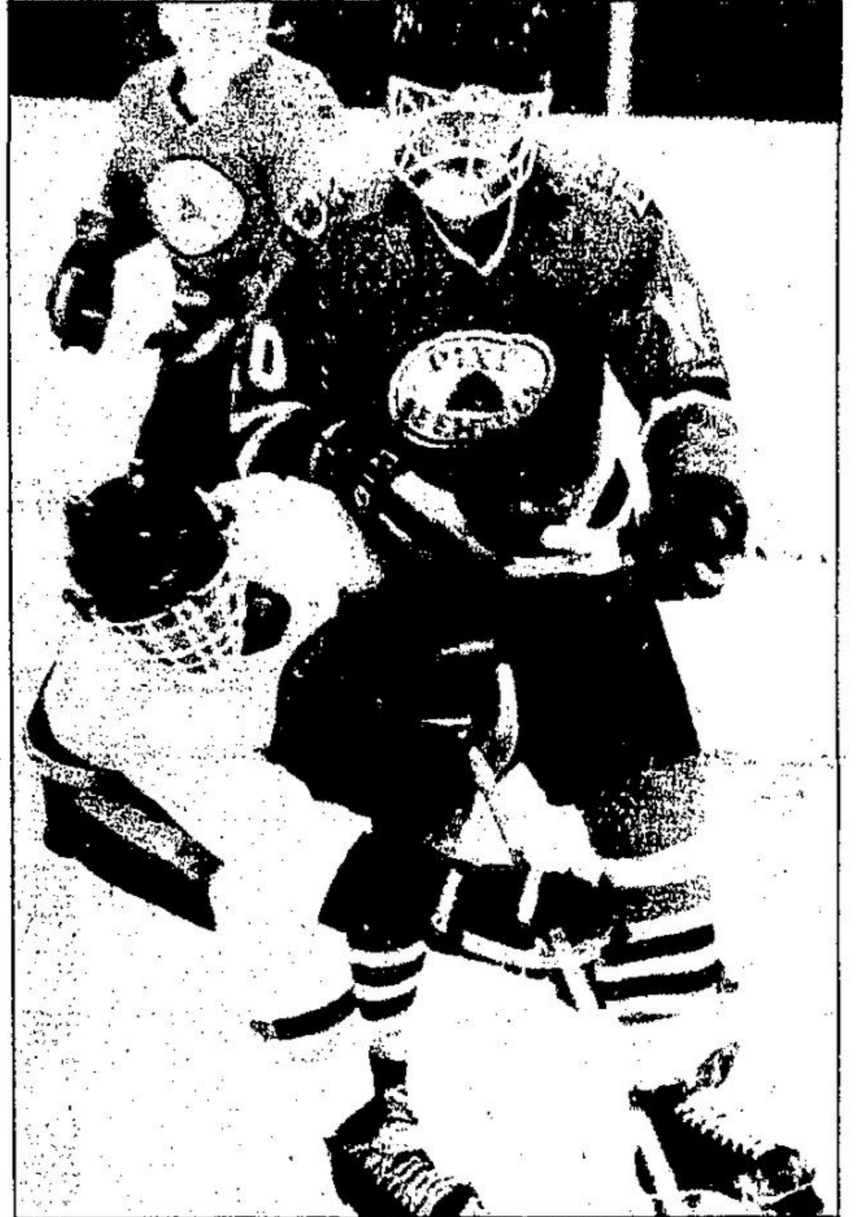
You take the high road, I'll take the low road: A Sabre manoeuvres around Dixie player's leg during Friday's game at the Community Centre. Sabres won the match, ensuring themselves a playoff spot and coupled with Sunday's victory over Thornhill put them in fourth place.