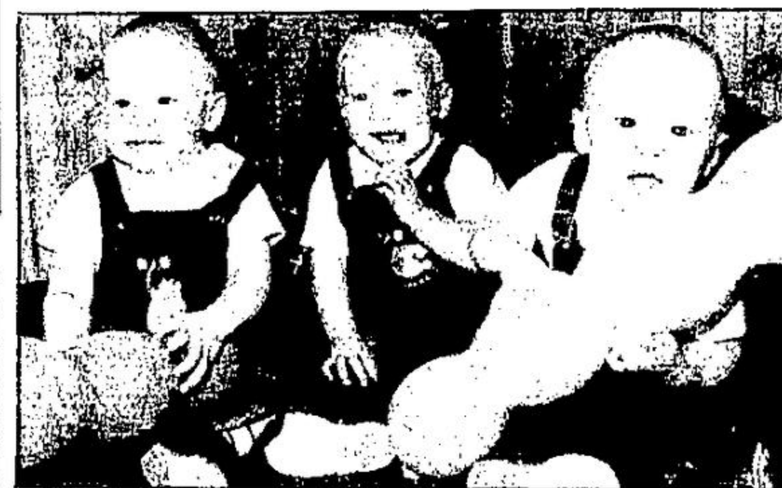
The McIntyre triplets celebrated their first birthday in September.