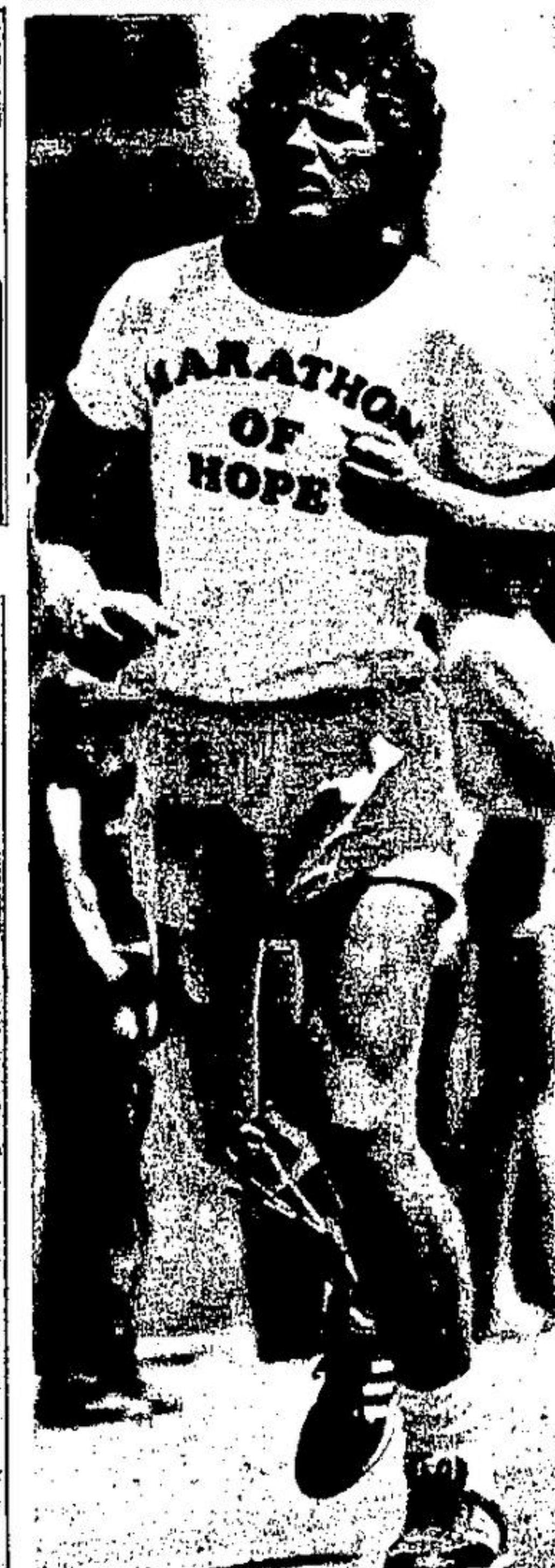
Terry Fox's visit here in July was one of the highlights of the year.