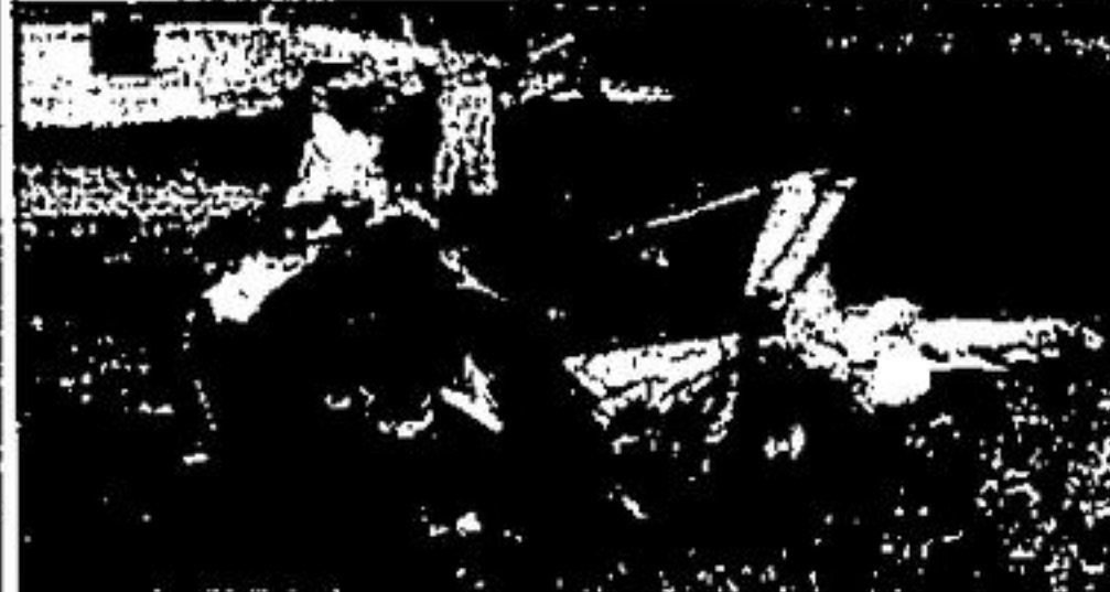
There was a plane crash in the summer in Erin Township.