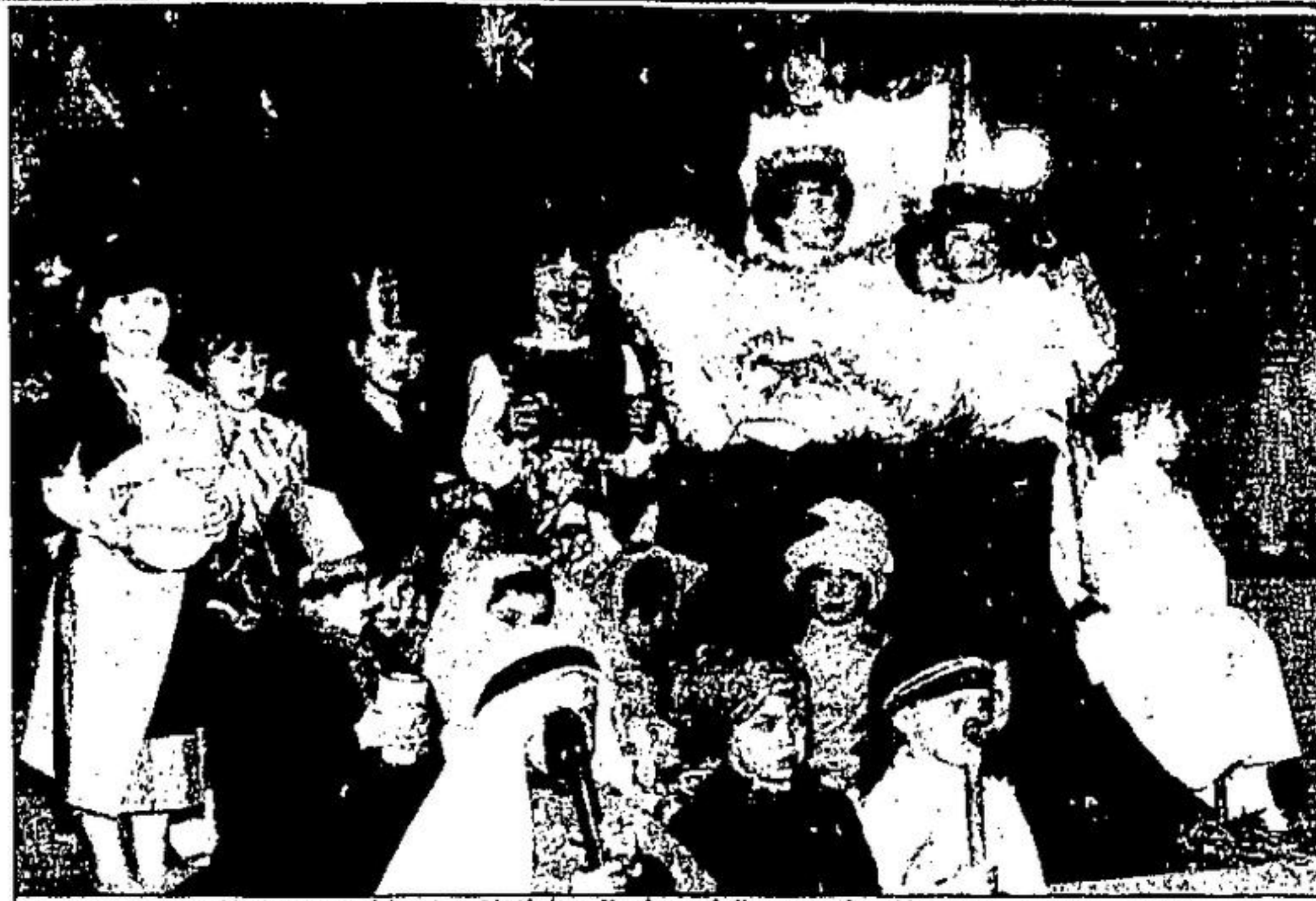
Christmas isn't Christmas without a Nativity. Rockwood Co-operative Nursery school invited parents and friends to their Christmas pageant last week. The four-year-olds created the traditional nativity scene.