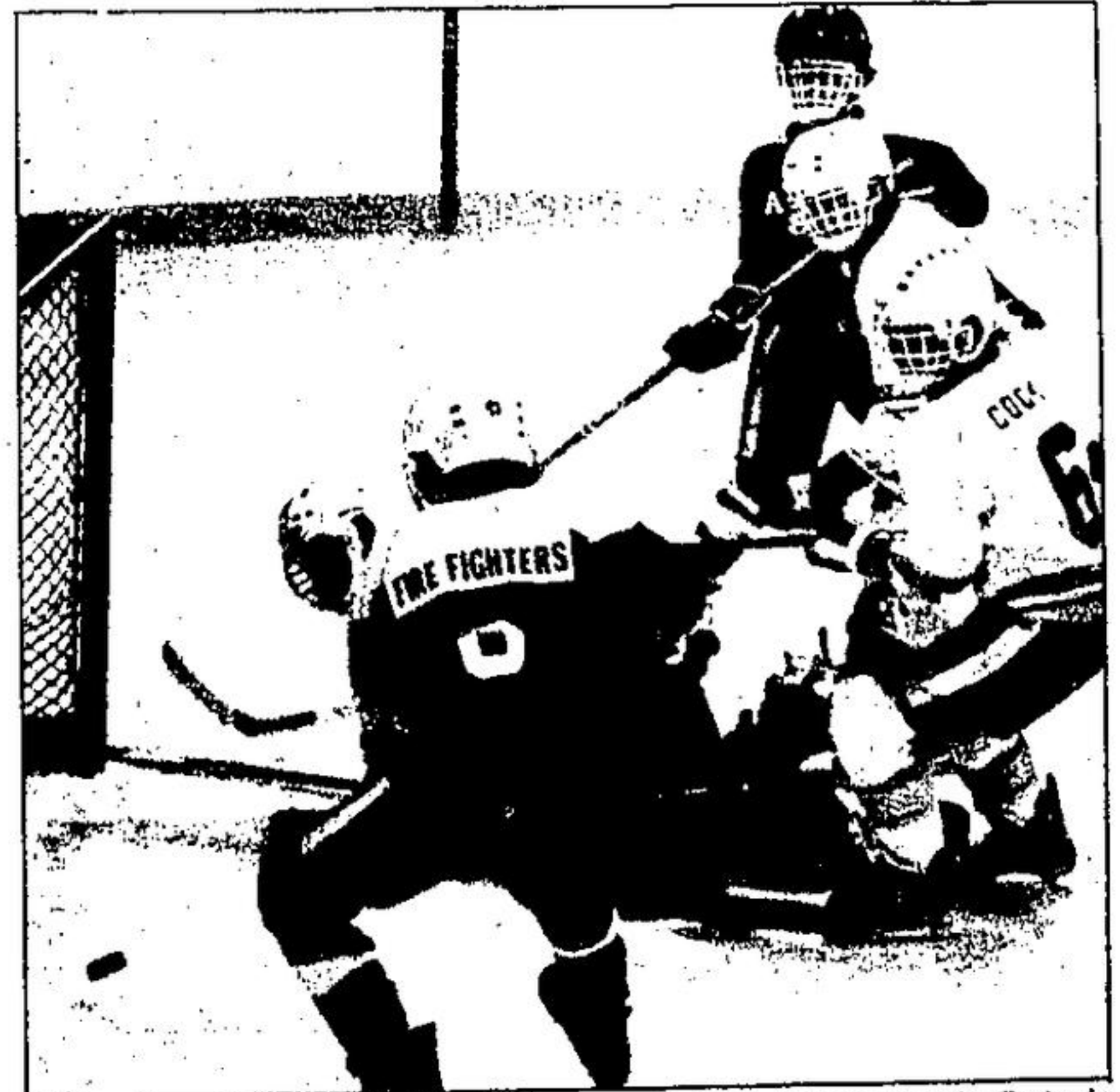
The Firefighter major bantams doused Elora Tuesday night at the Community Centre in Hub league action. Although Elora was short-staffed and put up a good fight, the Firefighters won it.