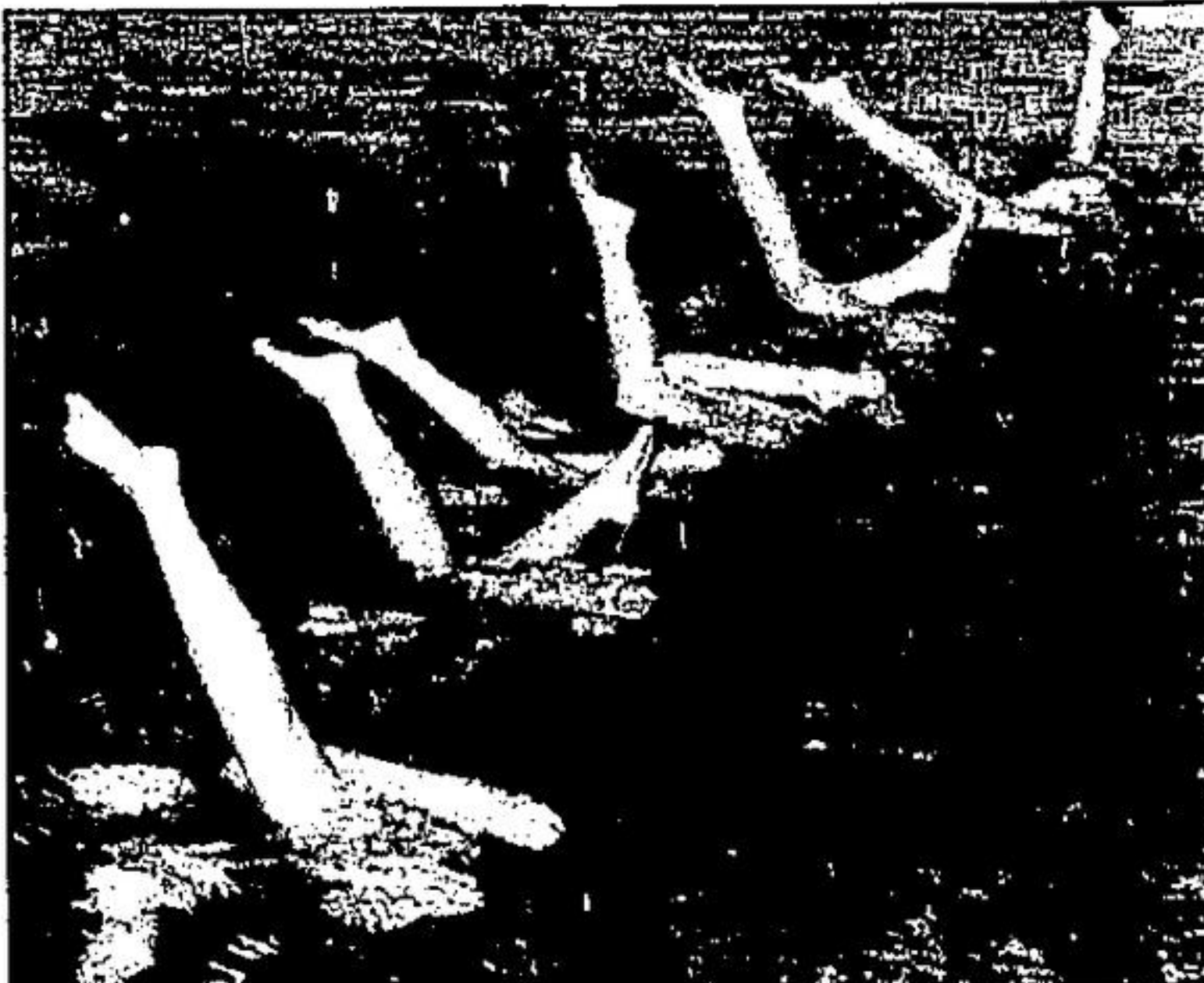
One of the highlights of Friday's seventh annual water show was synchro swimming displays.