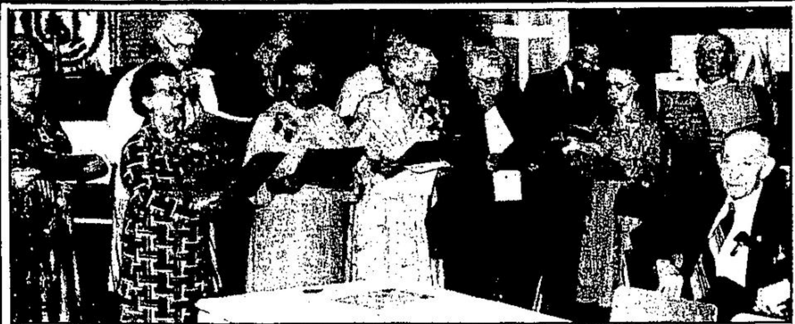
The Golden Age choir entertained their fellow seniors last Wednesday night at the group's annual Christmas party at Knox Presbyterian Church.