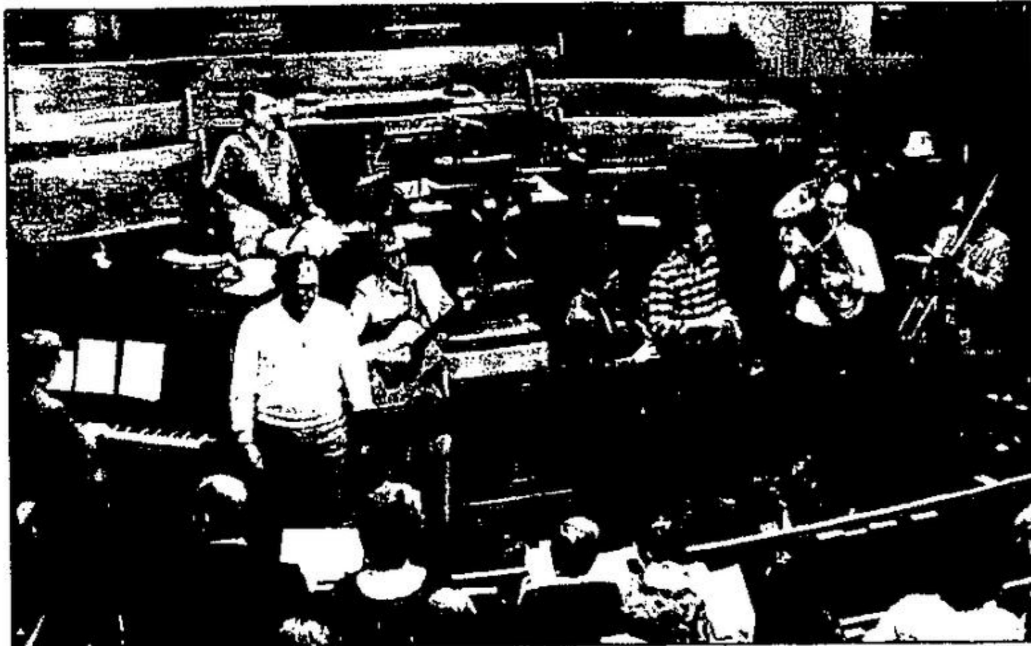
Among the entertainments Sunday at Knox Presbyterian Church was the music group the Lost and Found Department. The group, formed mainly of Presbyterian ministers, sang and played a wide variety of songs. They also got the congregation into the act.