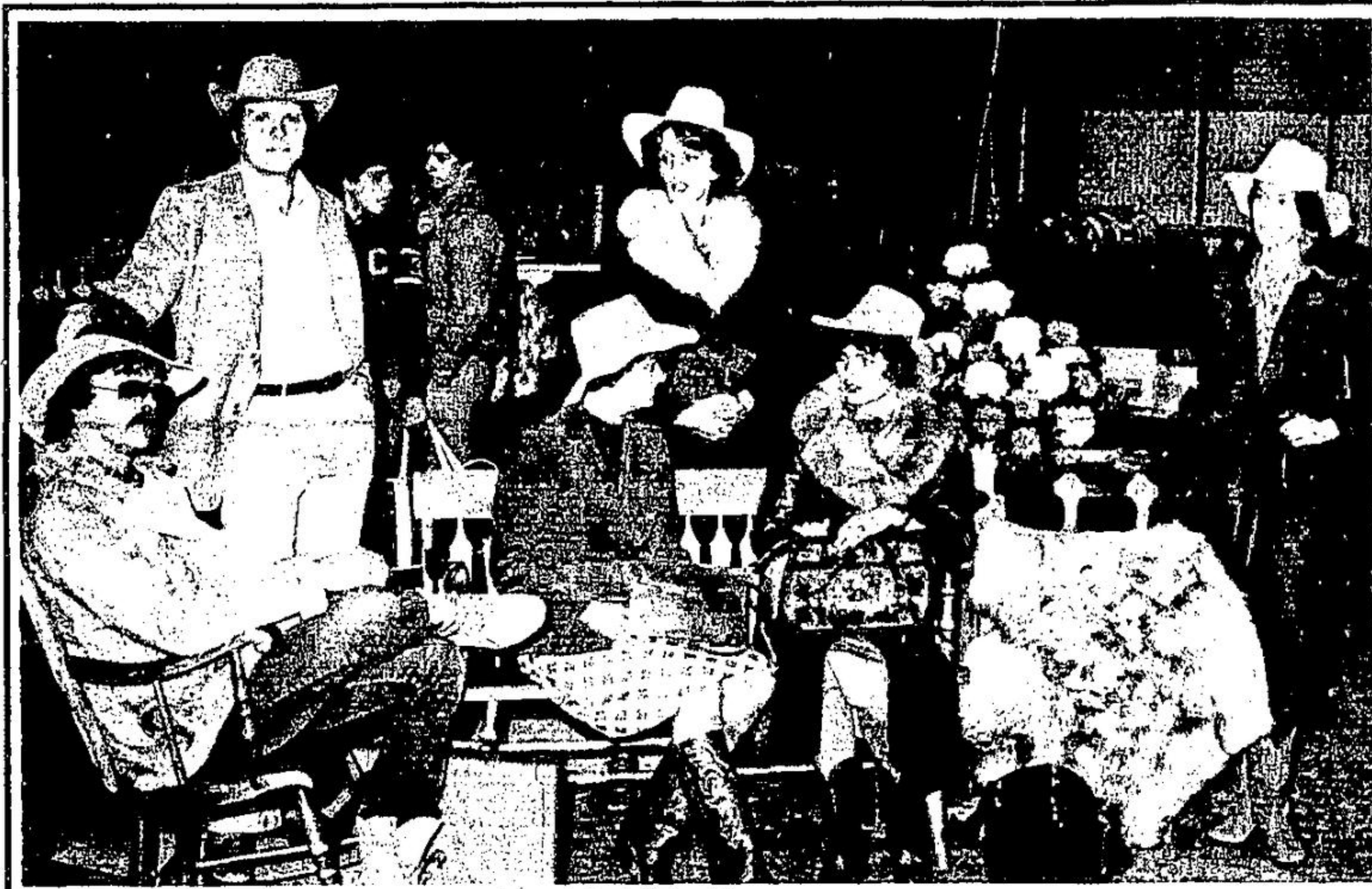
the old Hide House opens

Acton's newest and one of the biggest commercial ventures hatched in years, the old Hide House, opened to fair sized crowds over the weekend. Featuring leather and suede coats, jackets, pants, leather accessories, western wear, early Canadian style oak and pine furniture and sheepskin rugs. Here some of