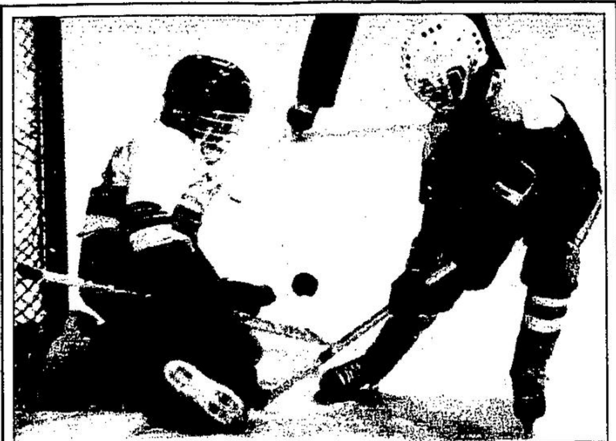
Close, but no goal for Acton minor peewees Wednesday in their 6-2 loss to Woolwich. The Beardmore peewees failed to capitalize on several scoring opportunities in the second, then stopped skating in the third period, handing the game to Woolwich.