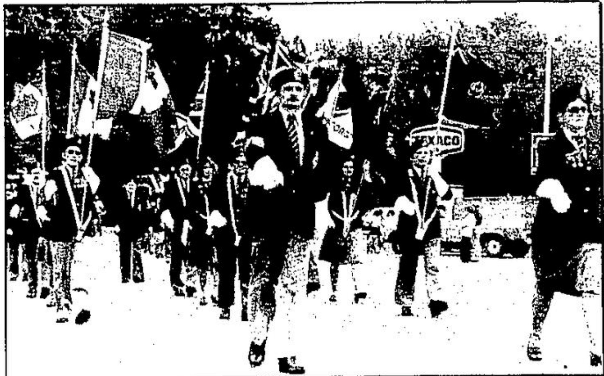
Members of Royal Canadian Legion Branch 197 marched in the parade.