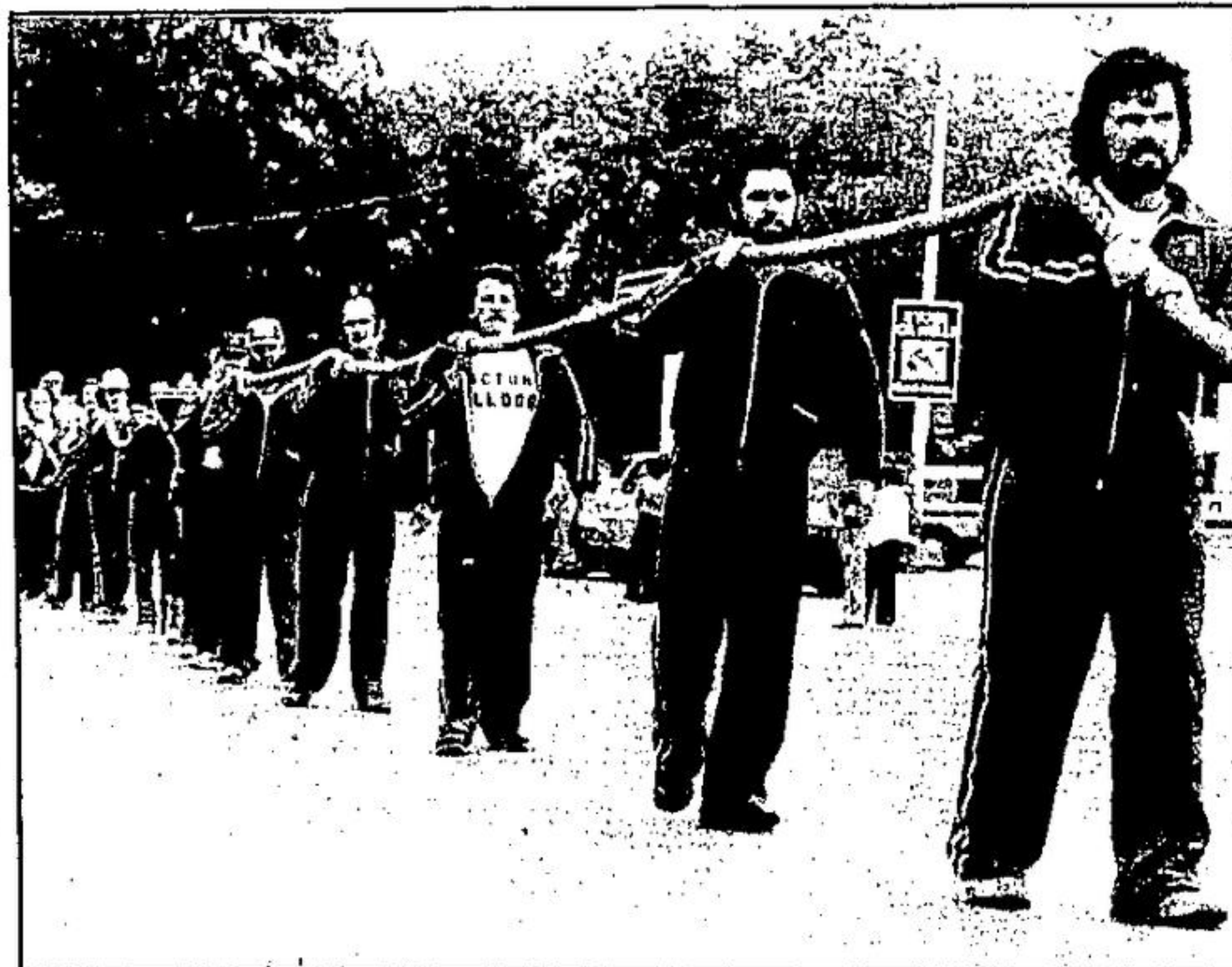
Acton Bull Dogs strung themselves together for the parade.