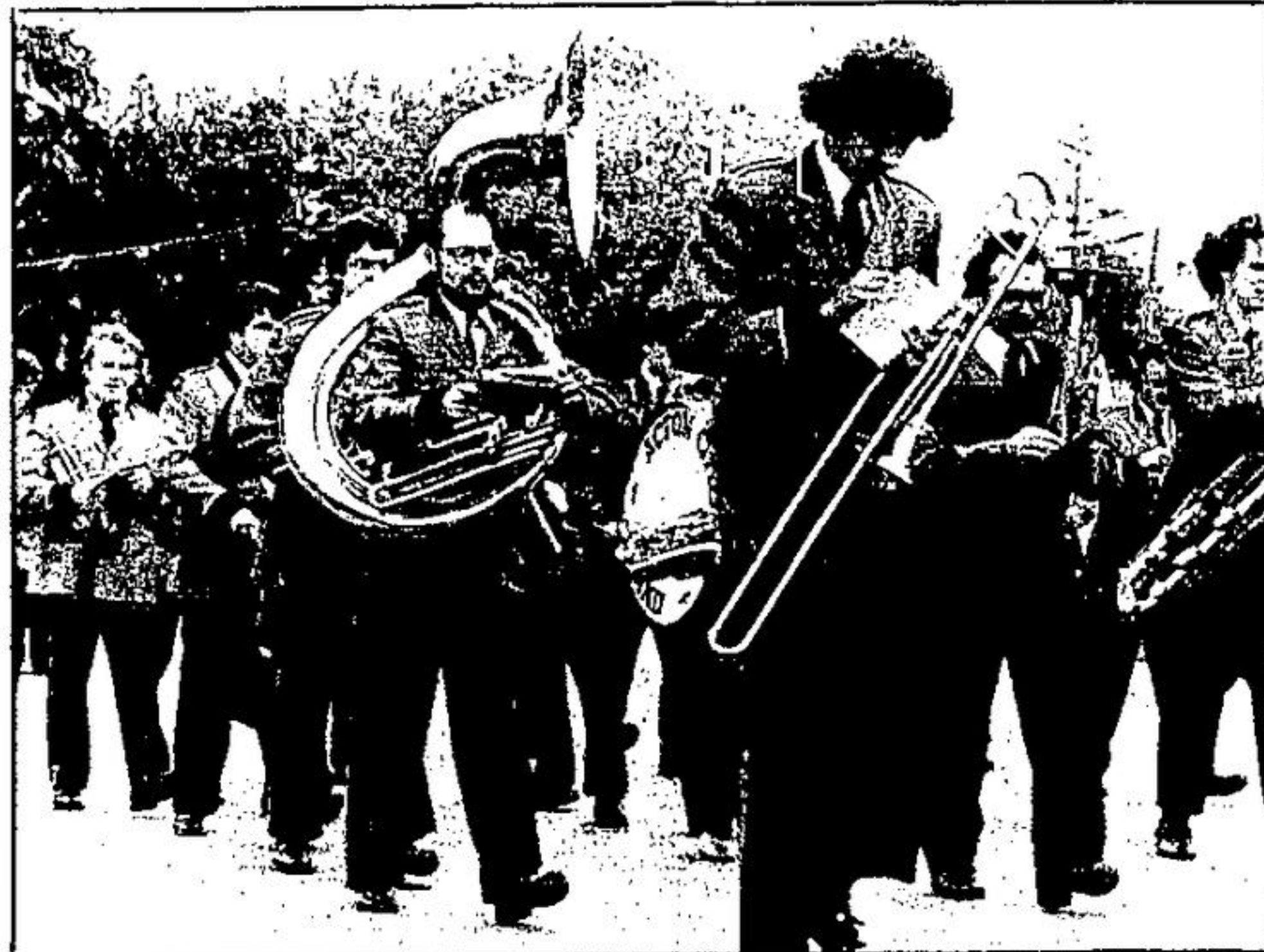
The Acton Citizen's Band presented spectators with the first music of the day.