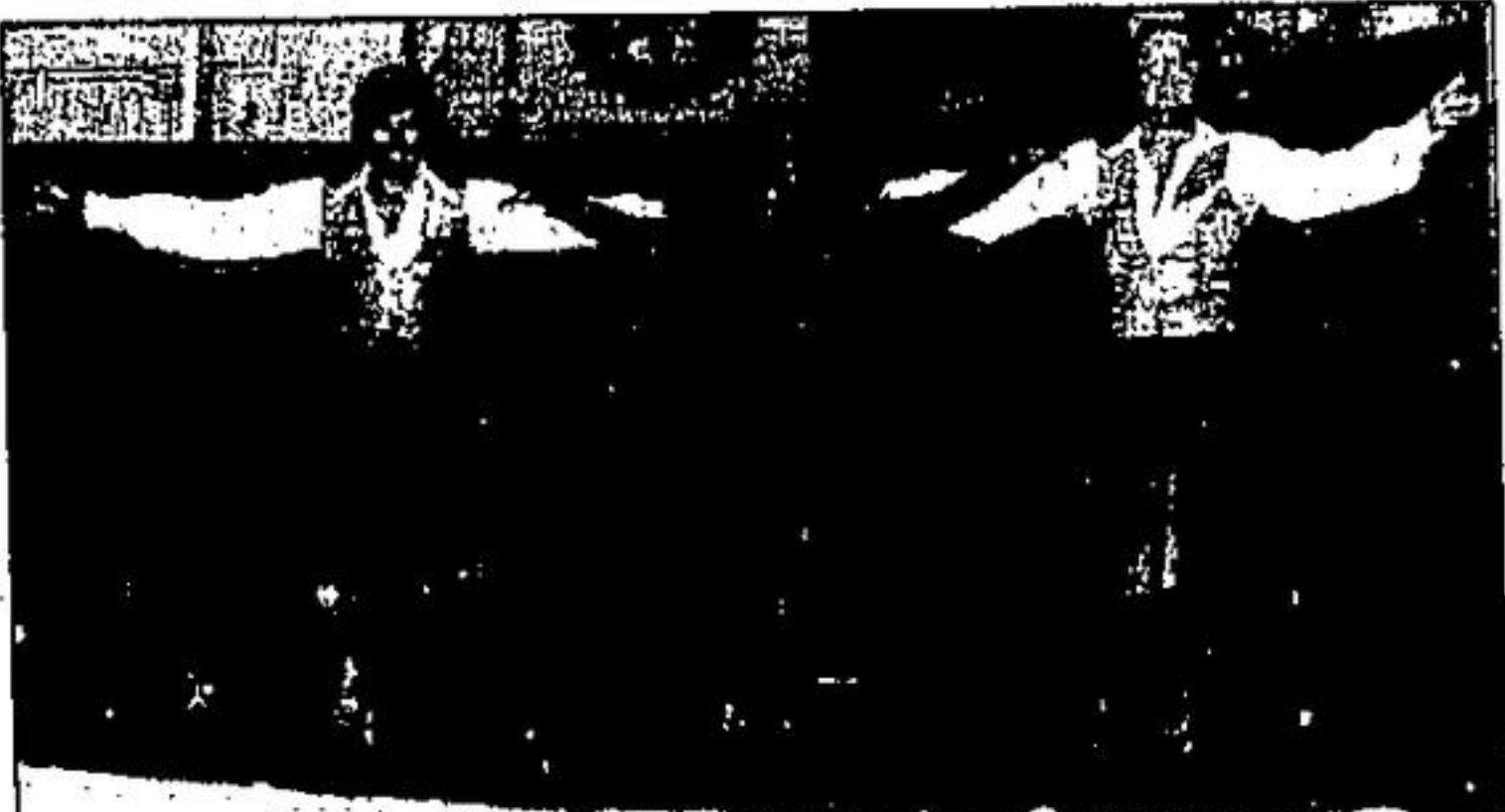
The Amazing Arlisses thrilled the Friday night crowd with unicycle and juggling tricks.