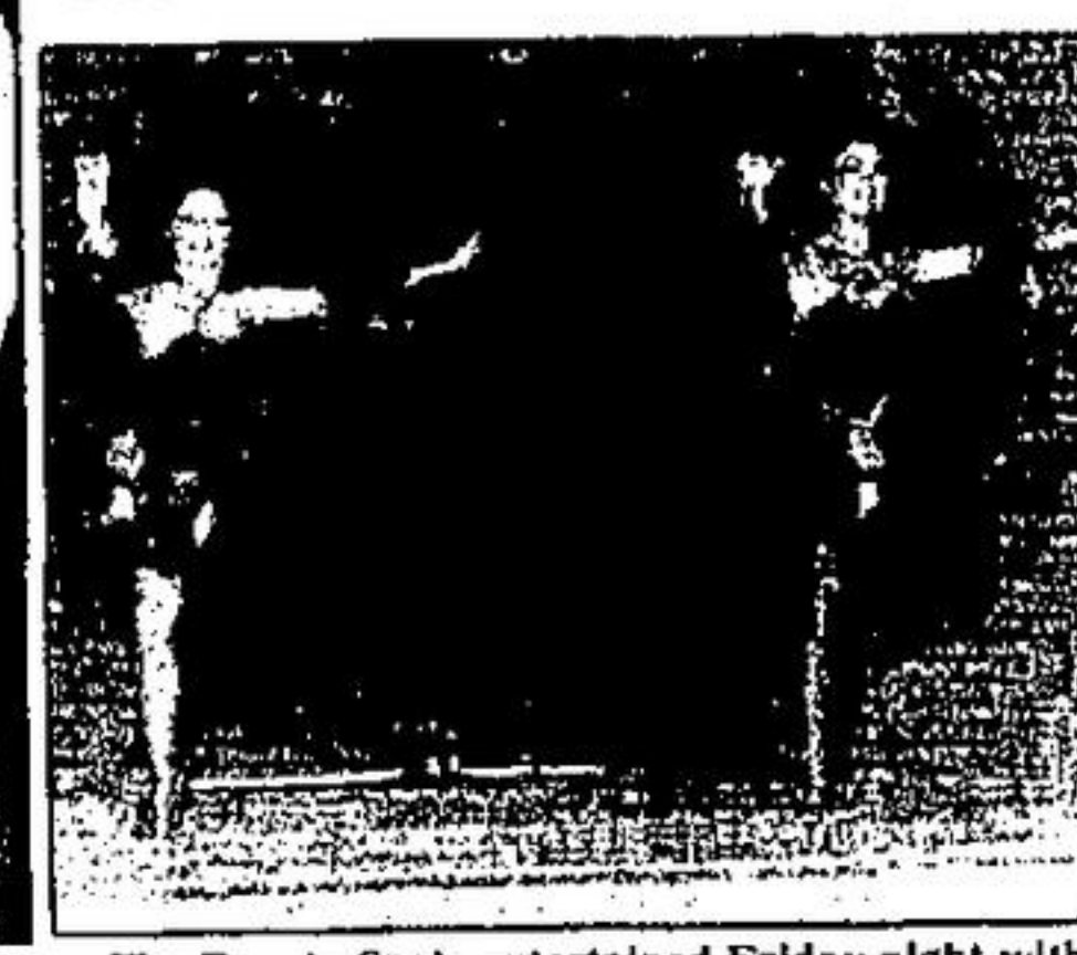
The Beauty Spots entertained Friday night with song and dance routines.