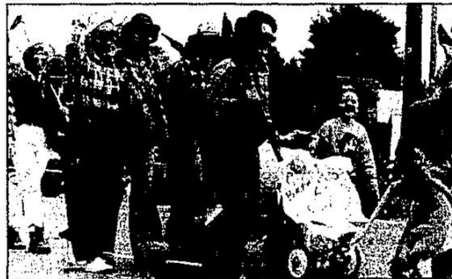
Beta Sigma Phi had representatives in the parade.