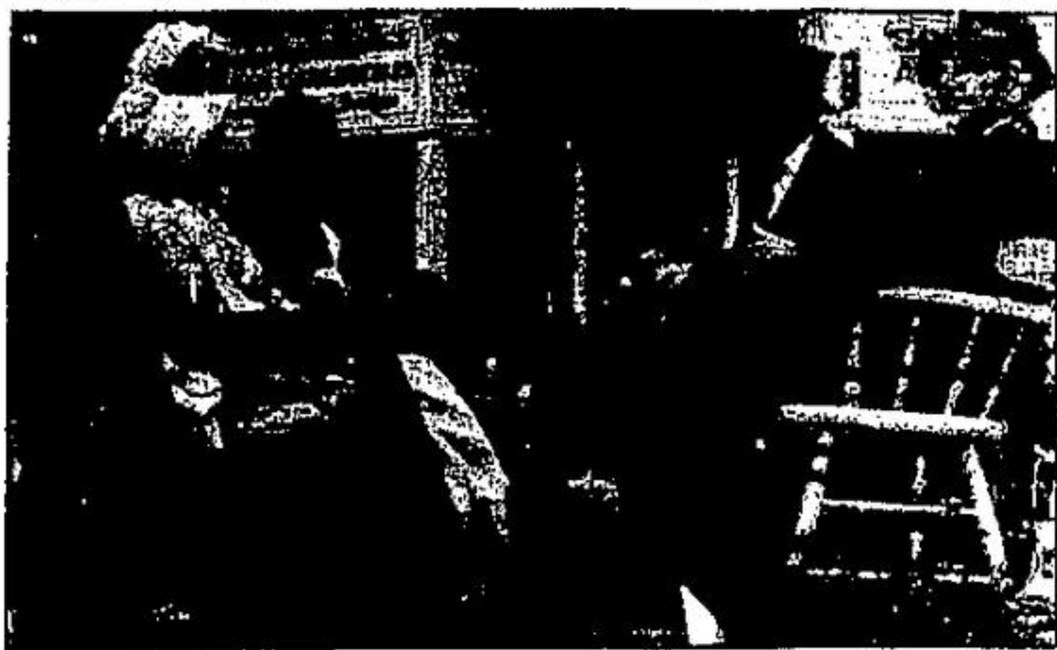
The Golden Agers delighted everyone with their float.