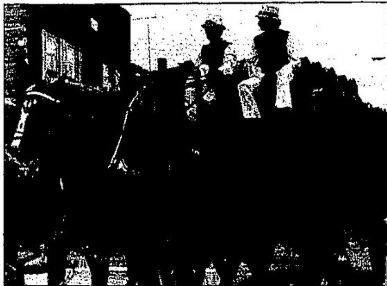
The famous Carlsberg team is a regular entrant in the parade and exhibit at the fair.