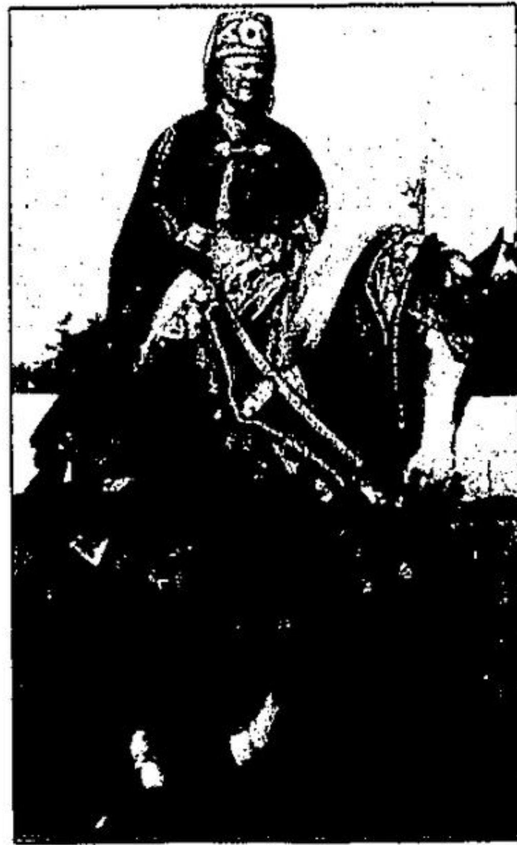
Arabian costumes attracted spectators at Friday's Arabian show, a new attraction for the fair. This entry won second in the Half-Arab Costume class.