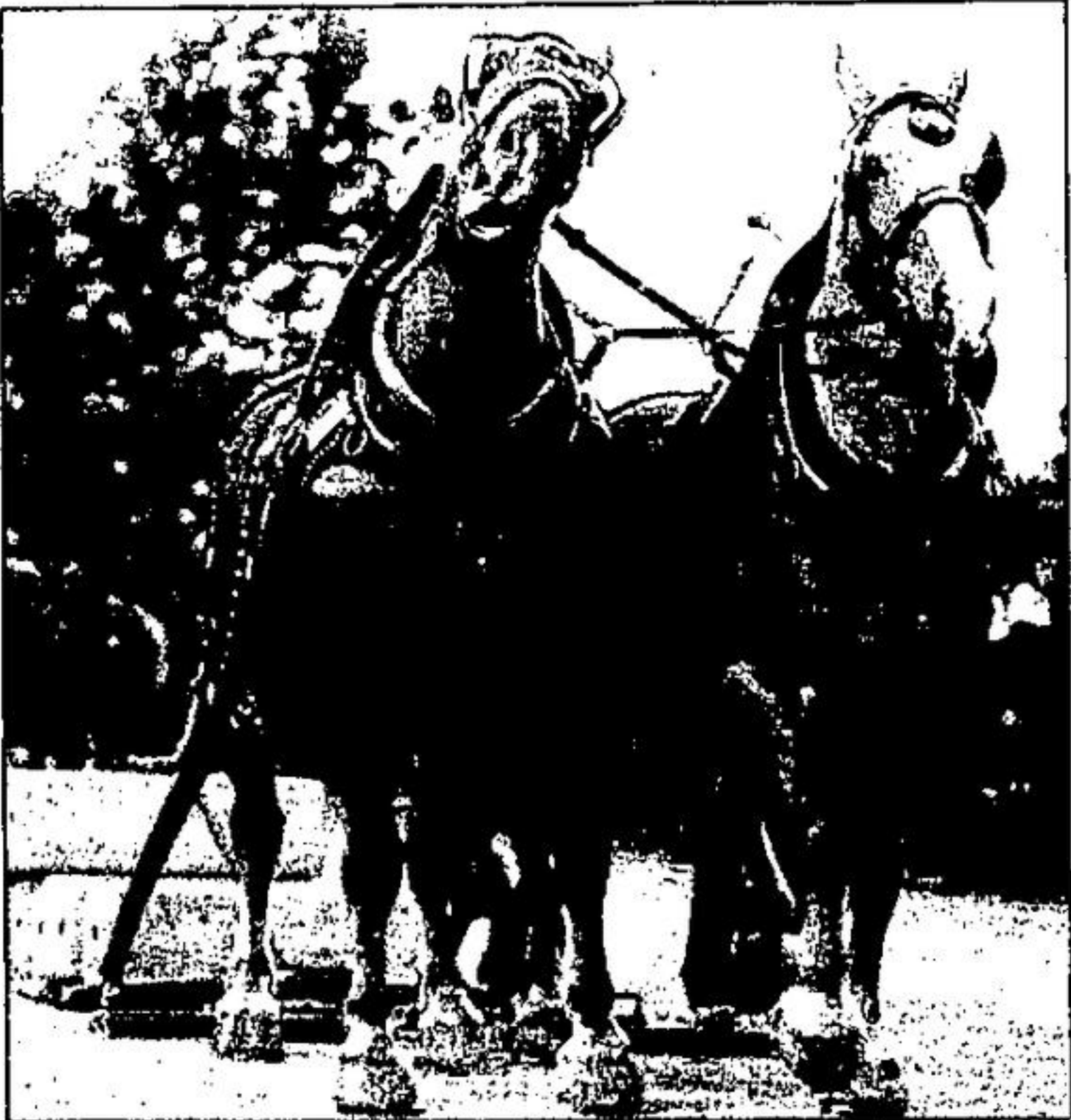
Light horses, girthing under 165" pulled their weight before the heavy horses got onto the track.