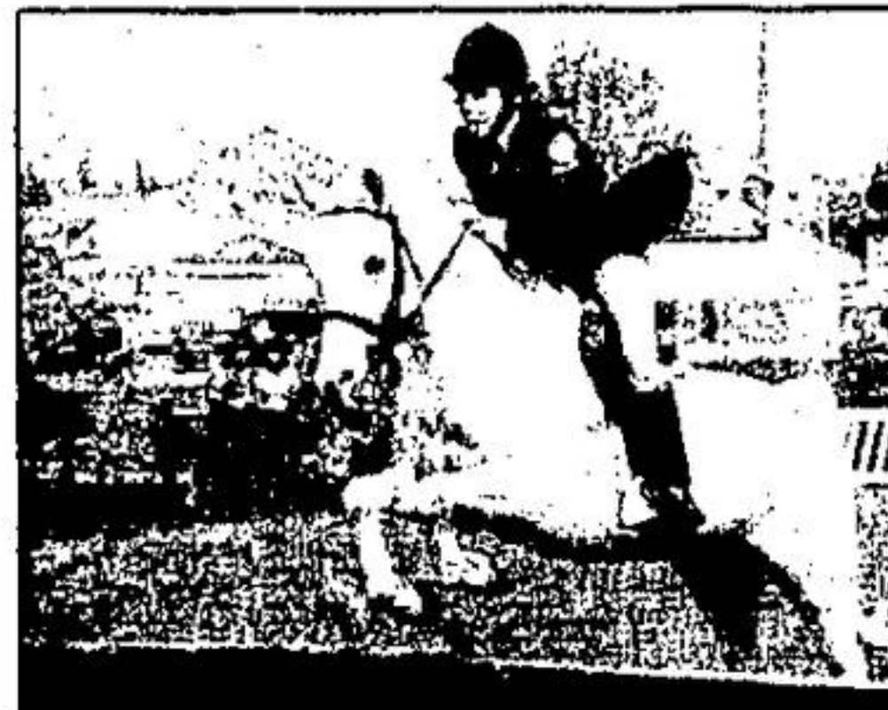
Pony jumping and hunting classes attracted many exhibitors from all over Southern Ontario.