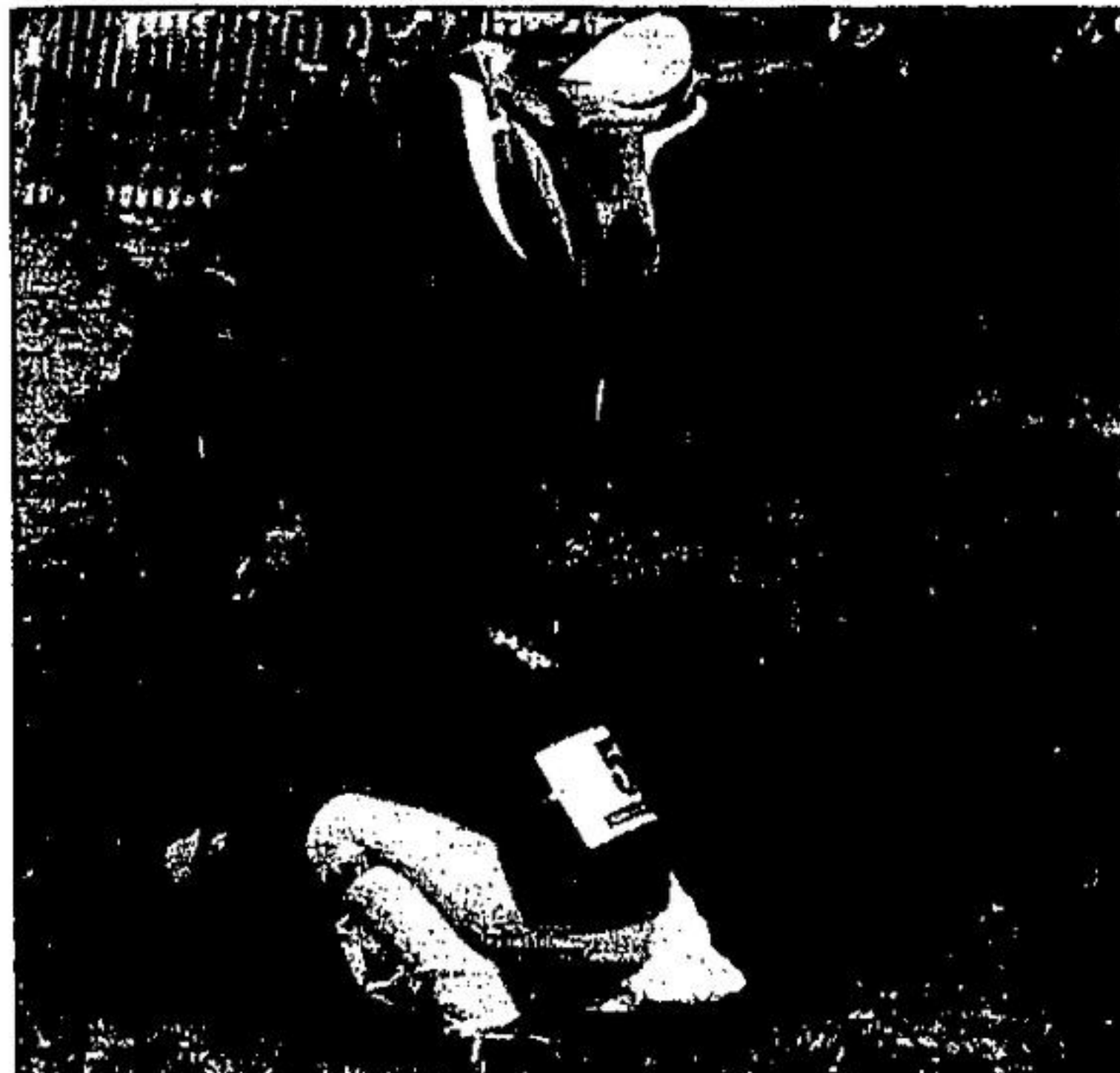
Sit on it - when you manage to grab a sack in musical pony sacks you make sure you keep it.