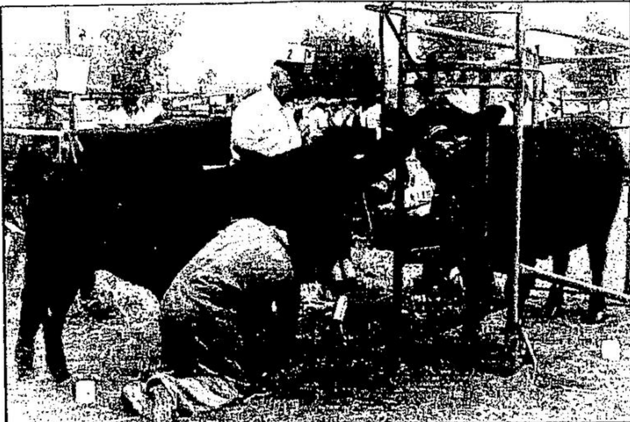
I'll scratch your back if you scratch mine. This is a heck of a way to spend a fall fair being prettied up for an Aberdeen Angus bull class.