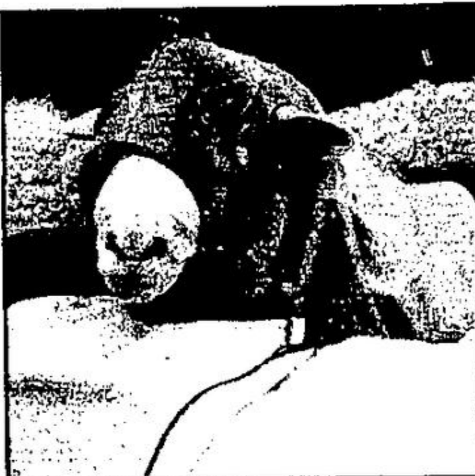
A bonnie brow bonnet for a wee sheep - fair sheep classes were full to brimming.