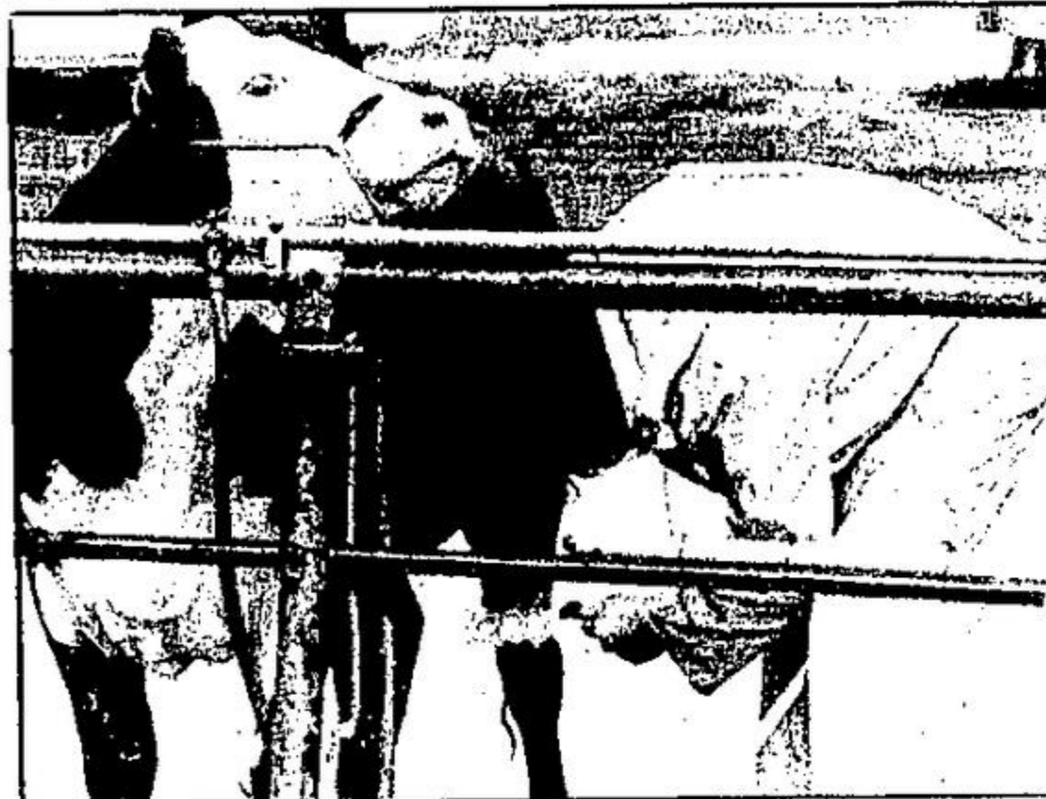
Bossy gets a bath before going on parade.