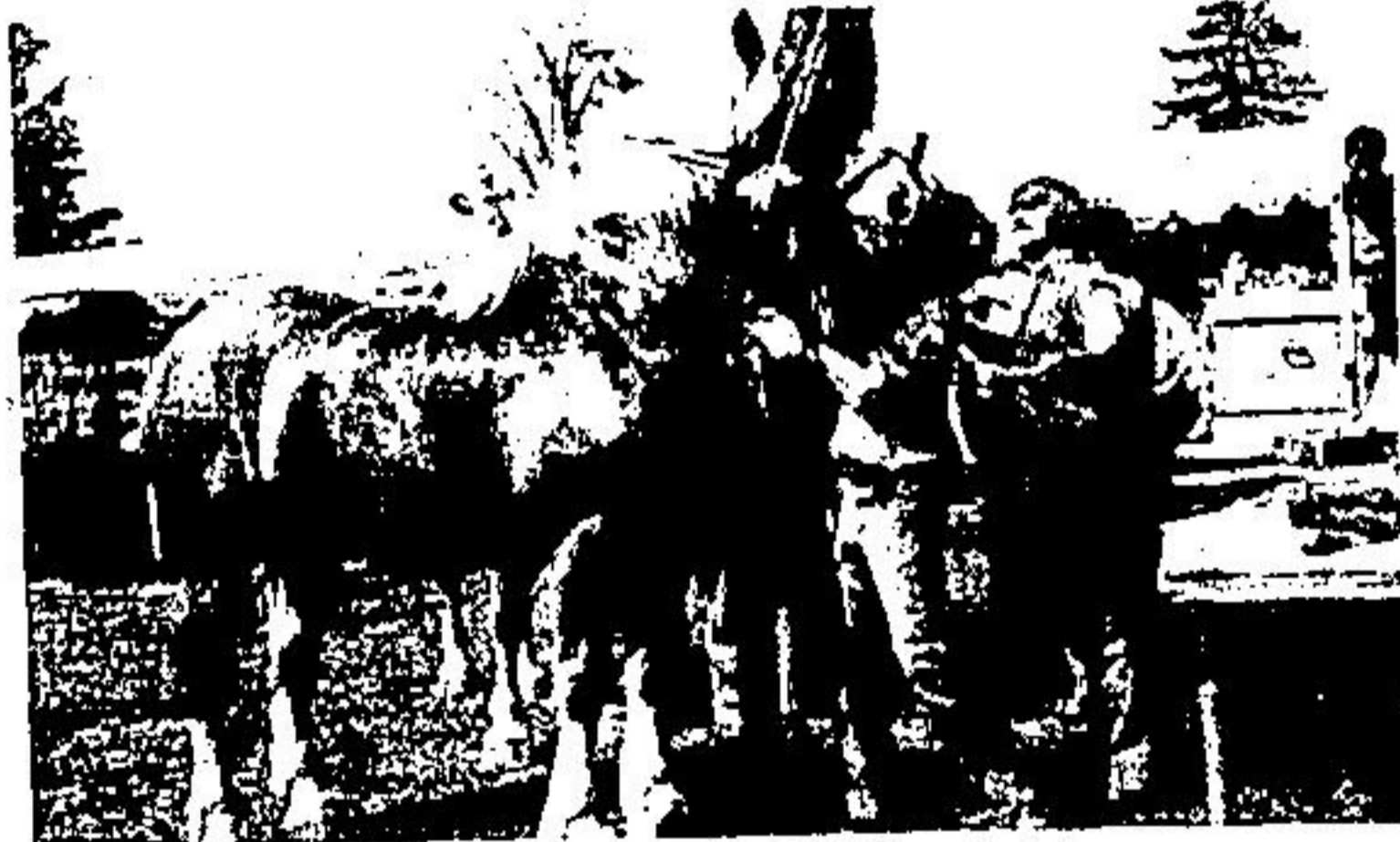
"Mind my ears" says this Carlsberg Belgian

Horses are bred and kept at the Palmer Farms in Schomberg home of the famous Carlsberg twins, twin Belgian fillies born this spring, the first ever in Canada. The twins made their appearance coincidentally close to the launching of Carlsberg's new light beer.