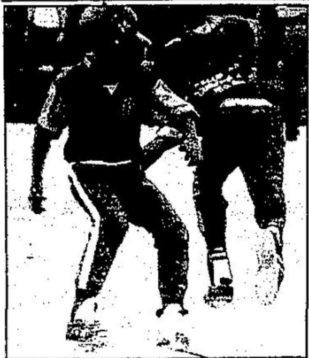
A Glen Williams runner reaches his base before Nellis Construction first baseman can tag him. Nellis lost the championship to Glen last Tuesday night at the M-Z Bennett diamond.