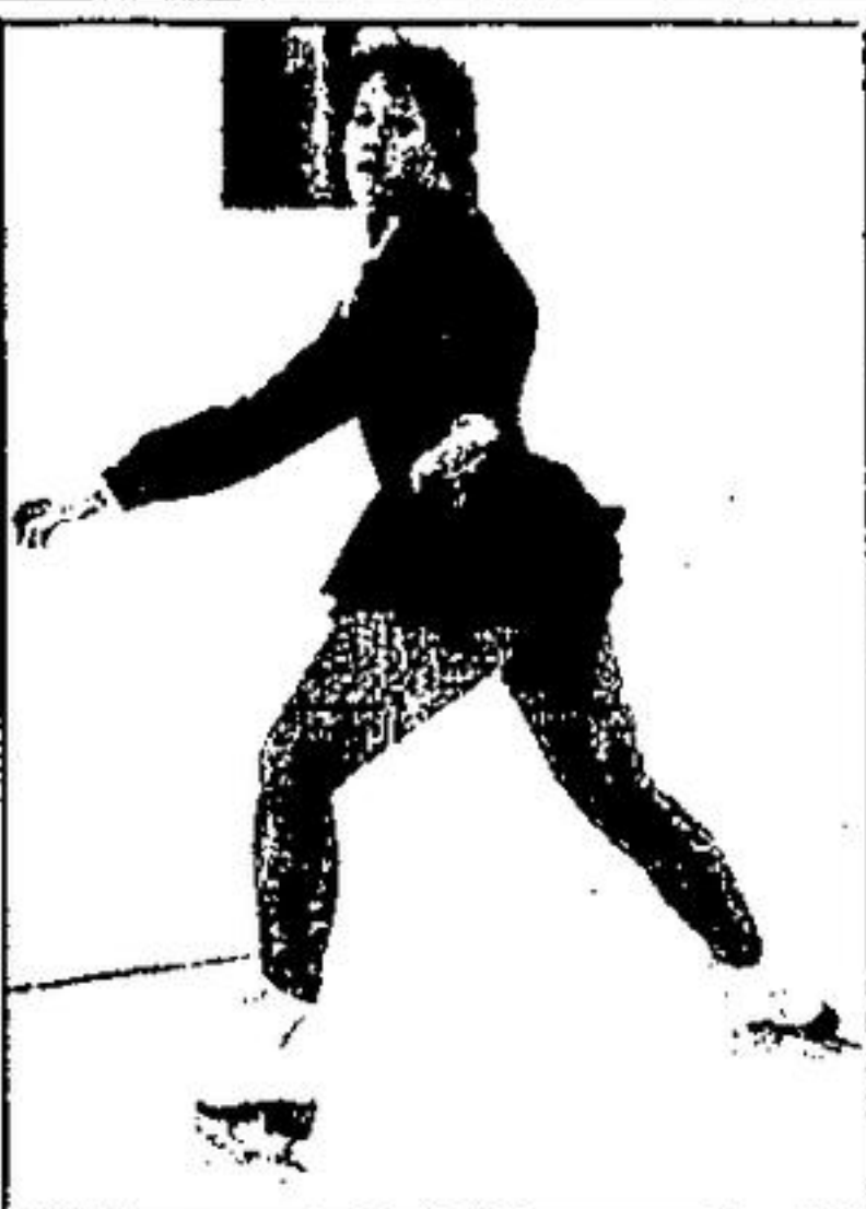
Figure skating: one of the many fall and winter sports around to keep you in shape.

Finally, if you've returned to school I'm sure the physical education teachers have cooked up a multitude of methods to keep you in shape.