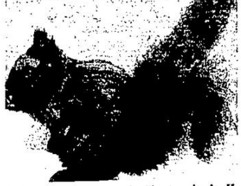
Rockwood isn't Rockwood without squirrels. If this little fellow is still alive he's a great-grandfather by now.