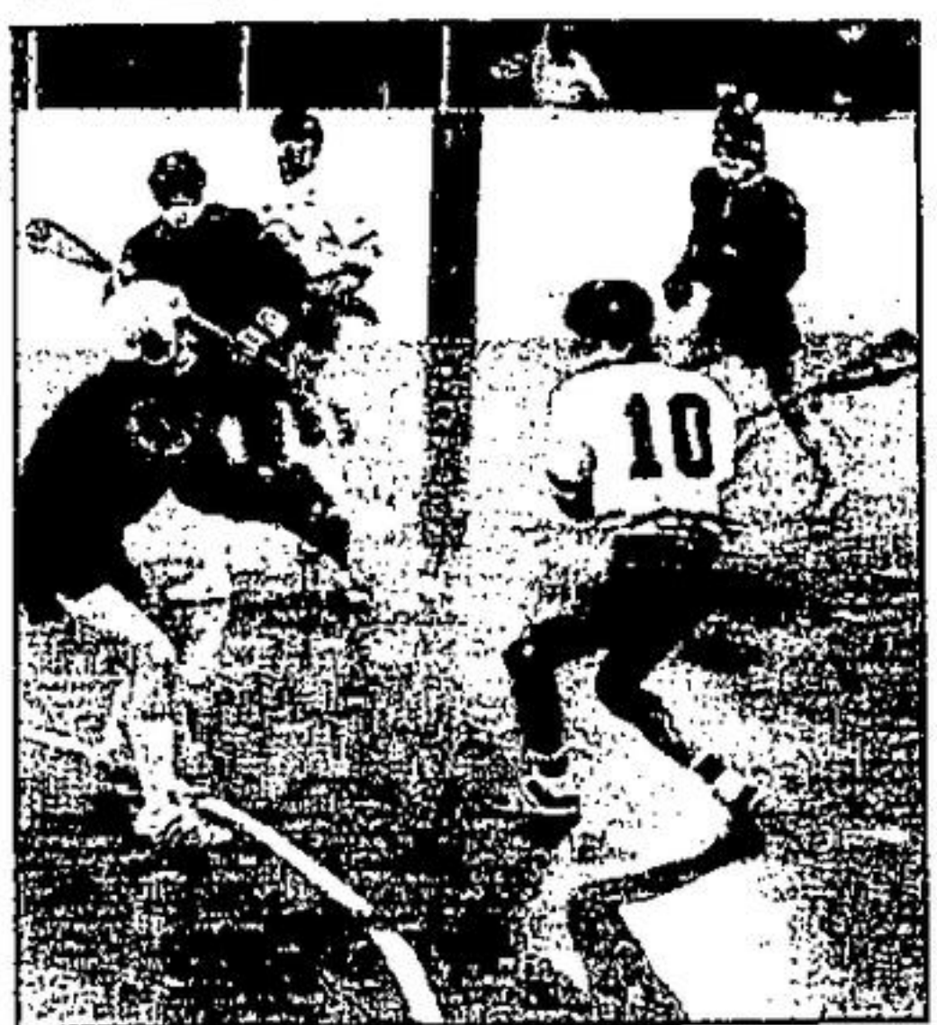
The Rams played in Mississauga Thursday — their final game of the Oldtimers lacrosse season, and won 14-10.