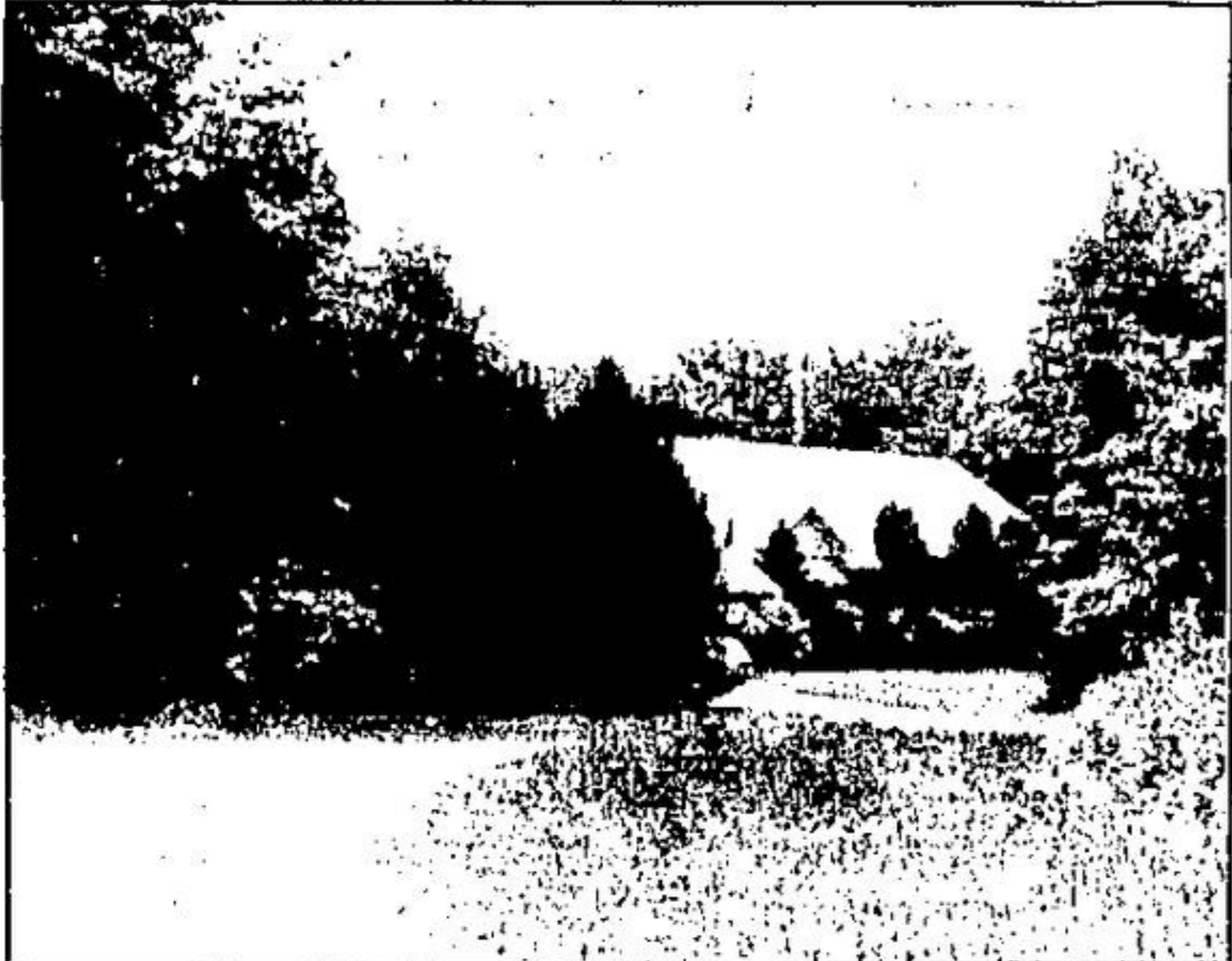
Halton Hills Centre is hidden off Highway 25 between Acton and Milton by large evergreens and a long, winding dirt driveway. It's a combination conference, training and redevelopment centre.