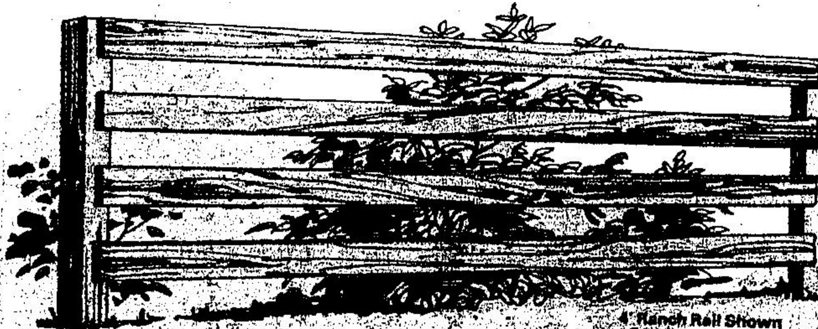
4' Ranch Rail Shown