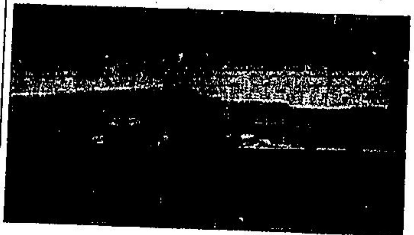
One of Thunder Bay's modern college complexes.