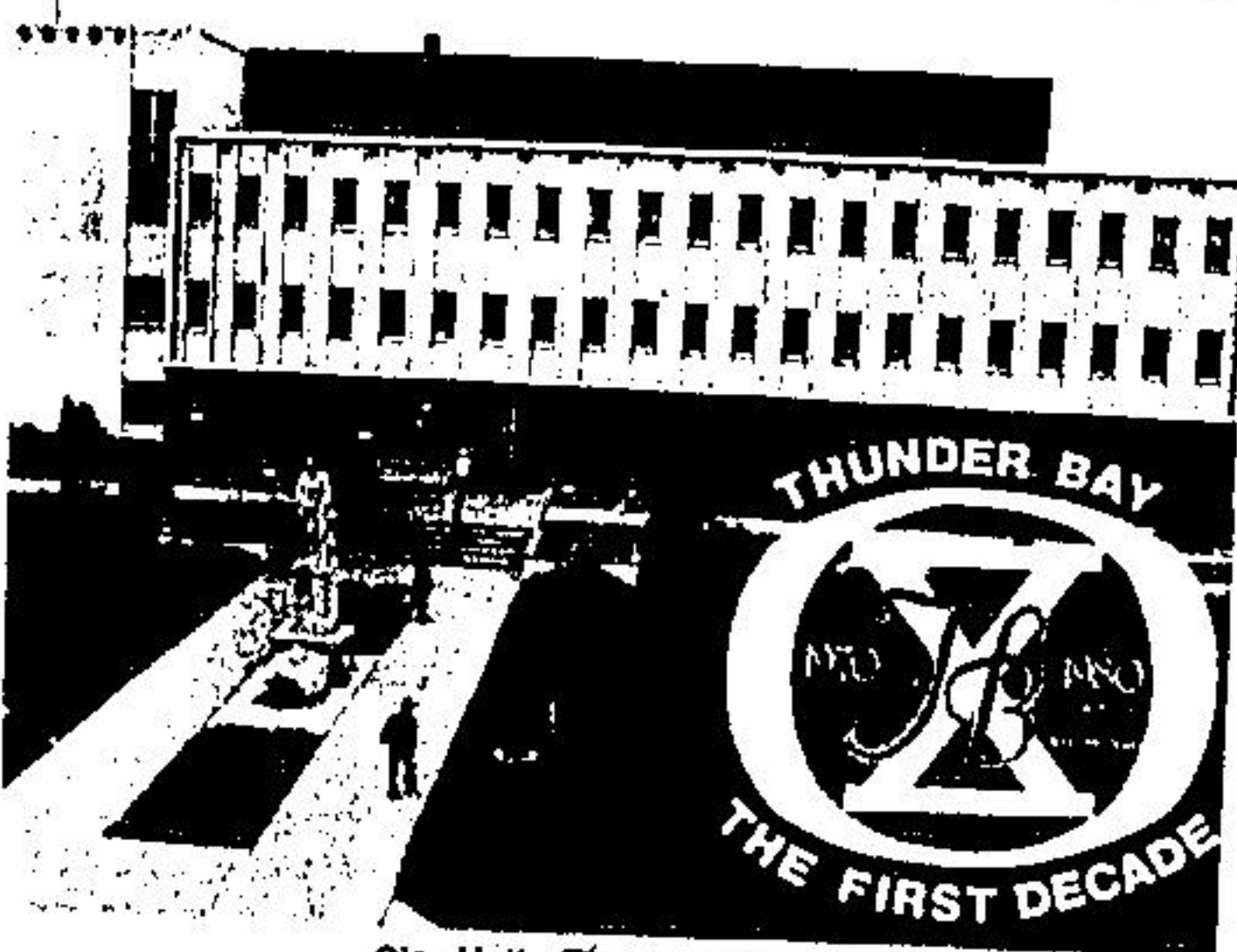
City Hall Thunder Bay, Ontario

Countless crystal clear lakes and rivers create a paradise for fishermen and hunters, campers and sightseers. Skiing, ice fishing, skiing — are all available during the winter months, making Thunder Bay the perfect place to go "just for the fun of it" any time of the year!