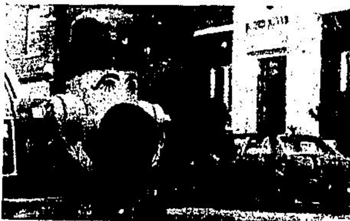
Sprucing up the parking meters was a project of Blind River students last year.

Blind River, like many other Northern towns, offers the utmost in modern convenience, coupled with all the outdoor activities imaginable. Thus, a vacation in the Blind River area can be as rugged or as comfortable as the visitor desires.