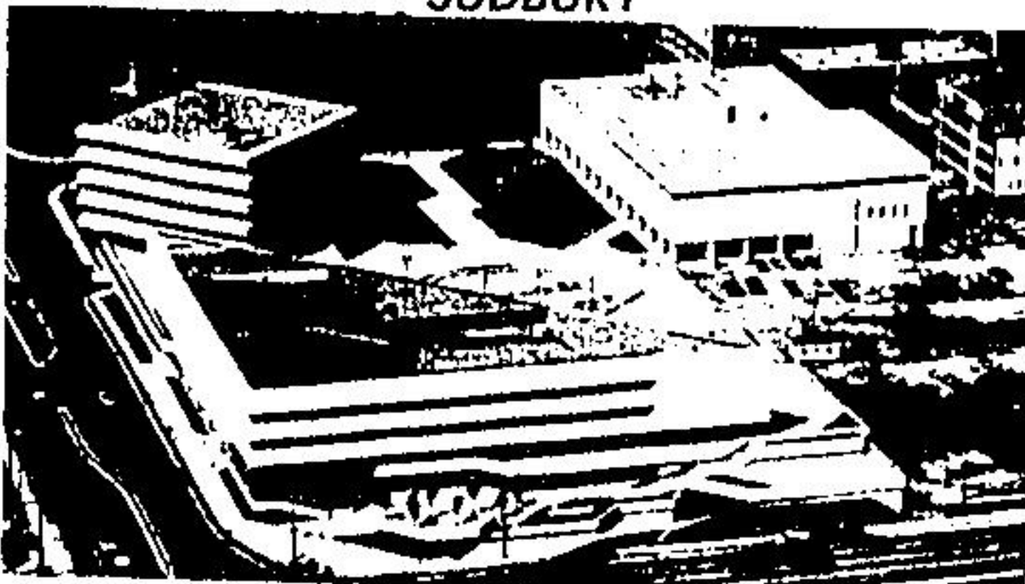
Sudbury's Convention & Visitors Services complex.

Sudbury is very much a "people place" where, in just a few minutes, you can move from the bustling activity of commerce or industry to the solitude of unspoiled lakes and woods. Numerous lakes wholly within the regional municipality provide almost 100,000 acres of water for swimming, boating, fishing, skating, hockey, water skiing, ice fishing and snowmobiling. Trout, pickerel, pike and bass abound in the 30-odd lakes which are readily accessible to the traveller.