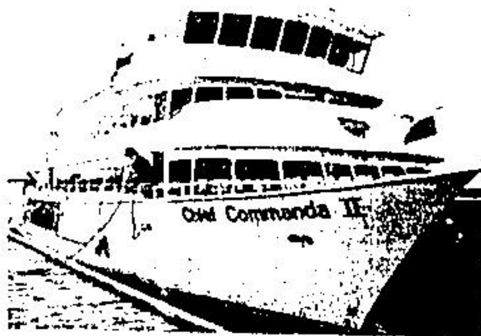
North Bay's Chief Commanda II tour boat