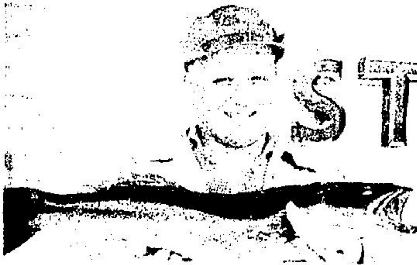
Fish where the big ones are—Elliot Lake & area.

Elliot Lake is like a breath of fresh air to the weary traveller.