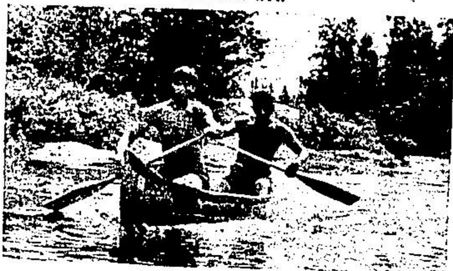
A peaceful scene on Lake Temagami.

Northern hospitality is at its best in friendly Temagami, as it nestles in the heart of a water-studded wilderness. Miles of rugged shoreline and hundreds of islands make it a place to relax, and to enjoy nature at its best.