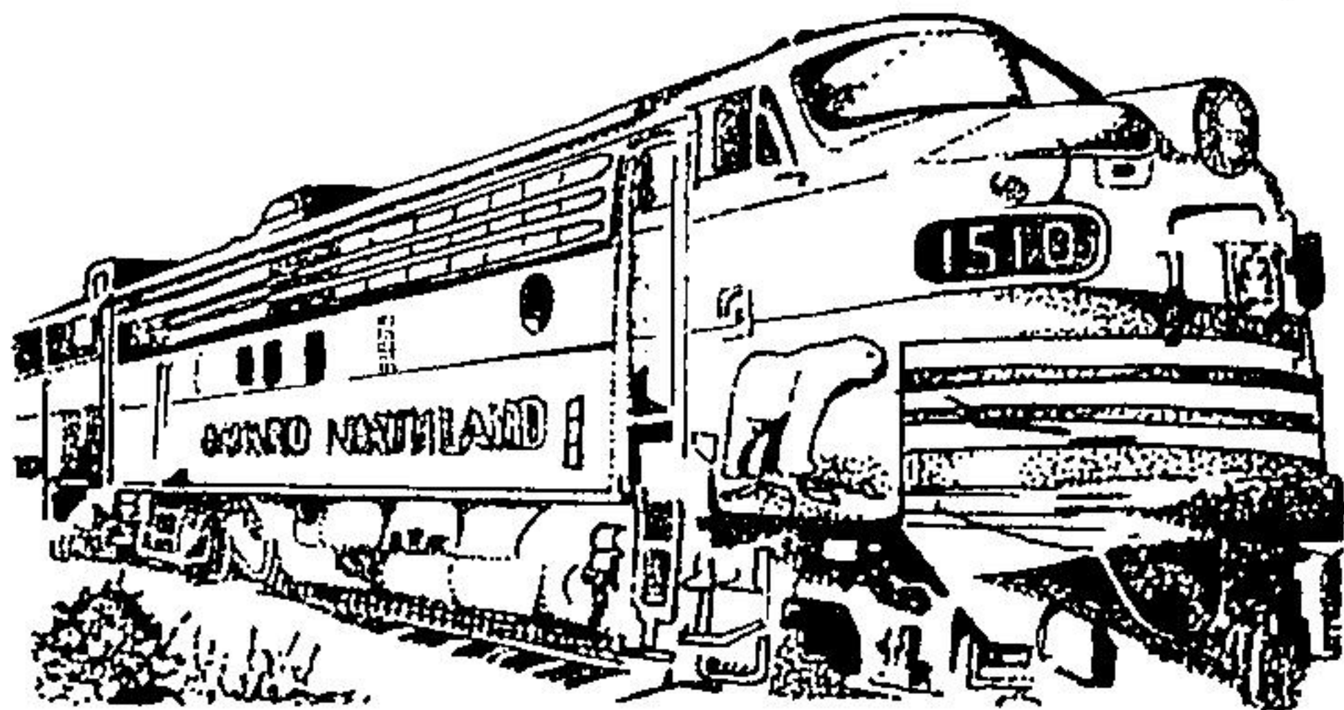
The Polar Bear Express

The Polar Bear Express is an exciting day trip "down" to the Arctic tundra of James Bay, which is part of Hudson Bay.