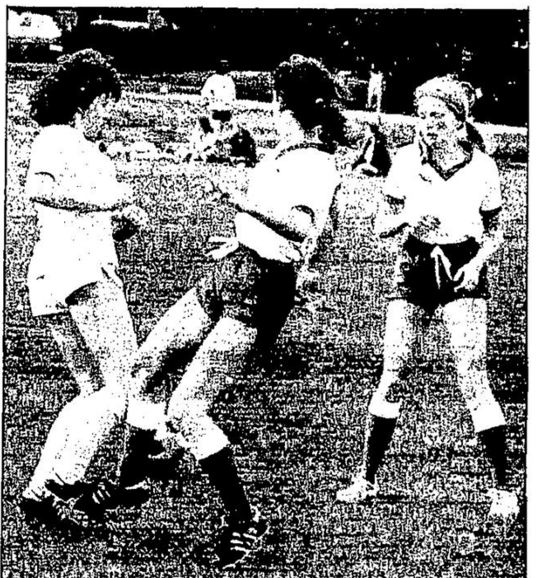
Acton girls soccer team, dark shorts, take to the field in their first game of the season last Tuesday. The Foxes lost to Pineview.