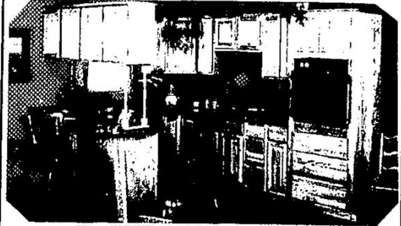
The 'EMERALD' Featured Above

On "TOP QUALITY" Kitchen Cabinets Kitchen of the Week!