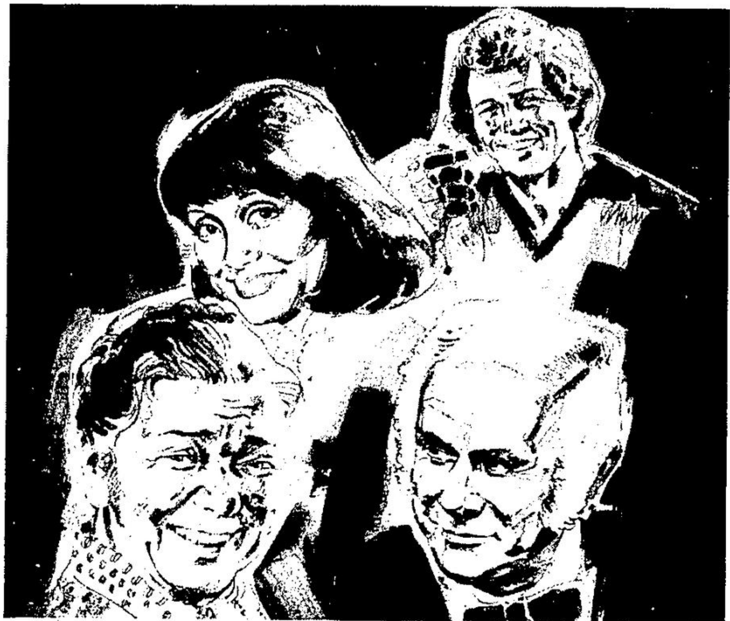
Clockwise: Hon. Pauline McGibbon, Adrienne Clarkson, Darryl Sittler, Pierre Berton