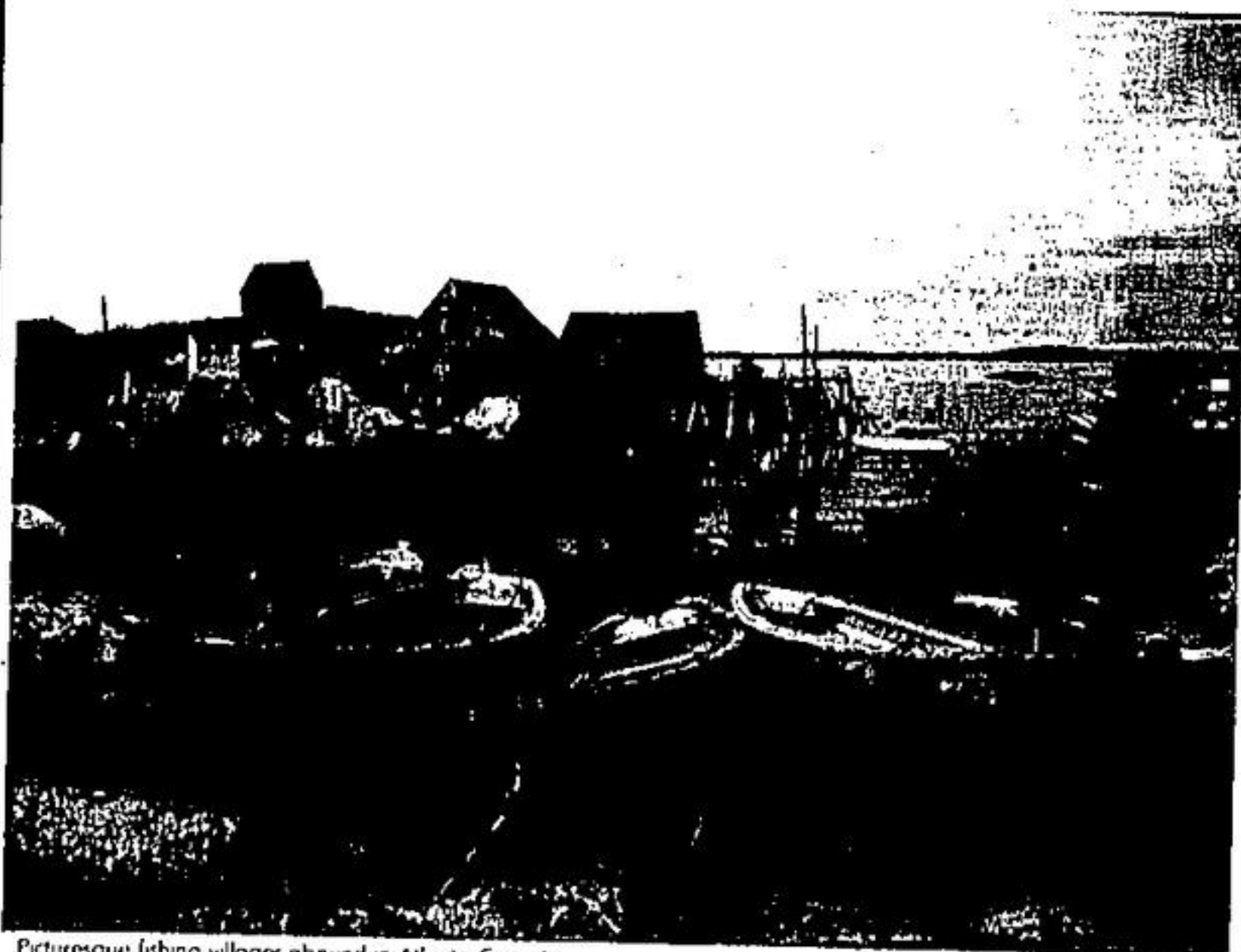
Picturesque fishing villages abound in Atlantic Canada