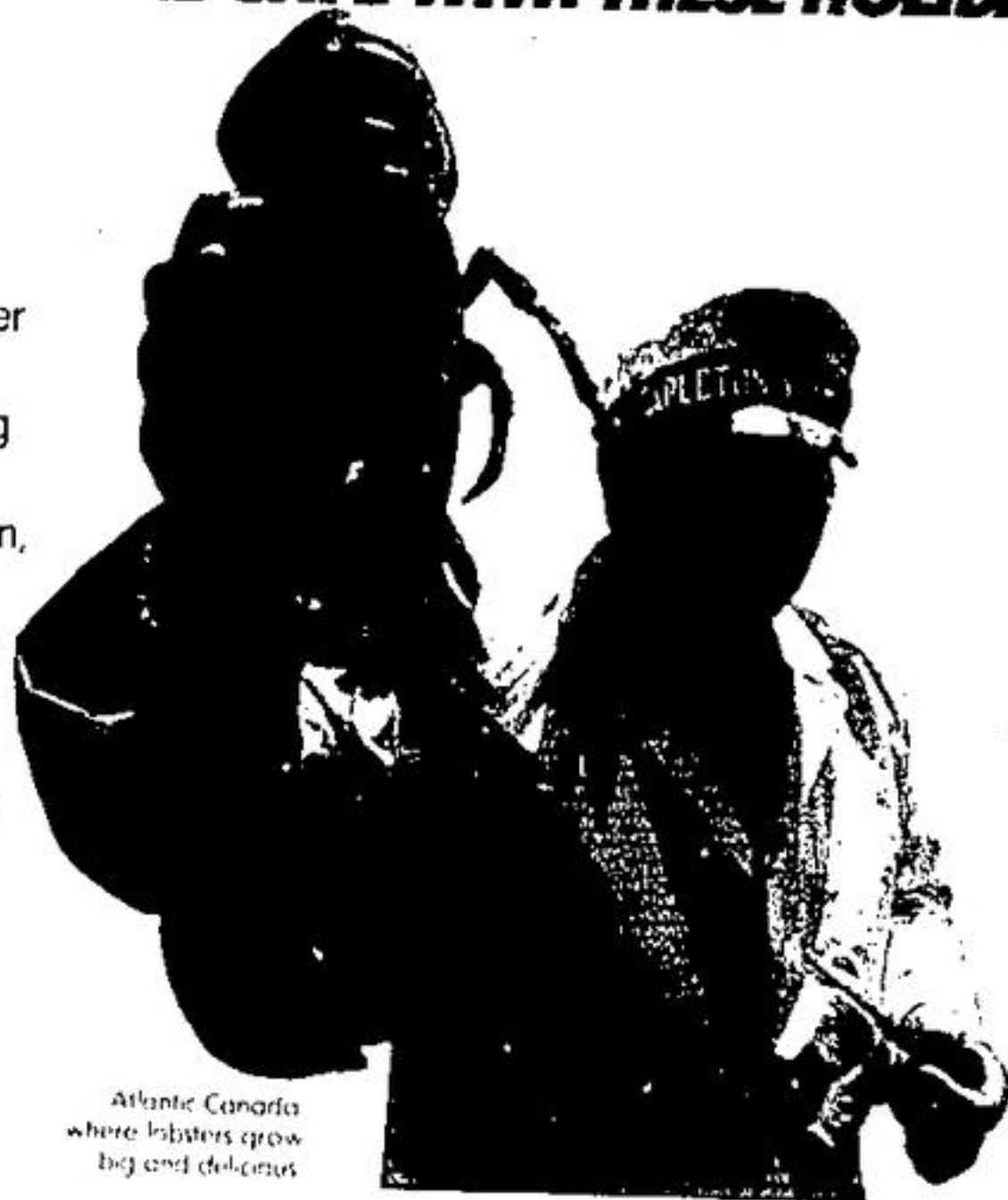
Atlantic Canada where lobsters grow big and delicious

The Atlantic provinces of New Brunswick, Nova Scotia and Prince Edward Island give you a chance to discover a really different side of Canada. The seafaring character of historic Halifax, the lush greenness of Prince Edward Island, the highlands-like-Scotland along the Cabot Trail, the sleepy hamlets and picture-book fishing villages—and everywhere, the ocean, 1000 miles of sandy beaches and the best seafood in Canada. All from only $78 a day for land transportation from Montreal or Toronto, fine hotels, some meals and sightseeing. 8 nights, 9 days from $703. (Air fare extra)