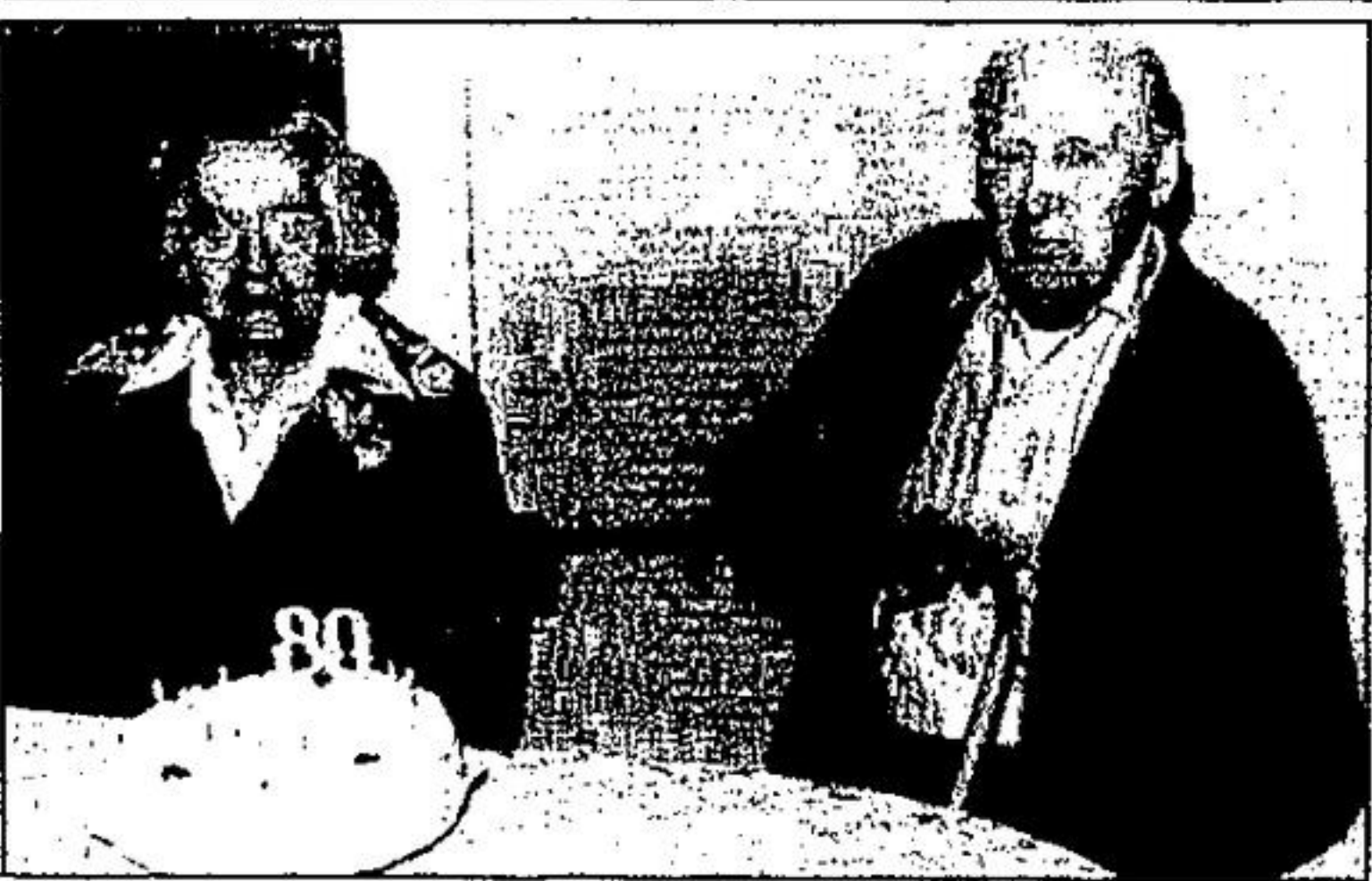
80 years young