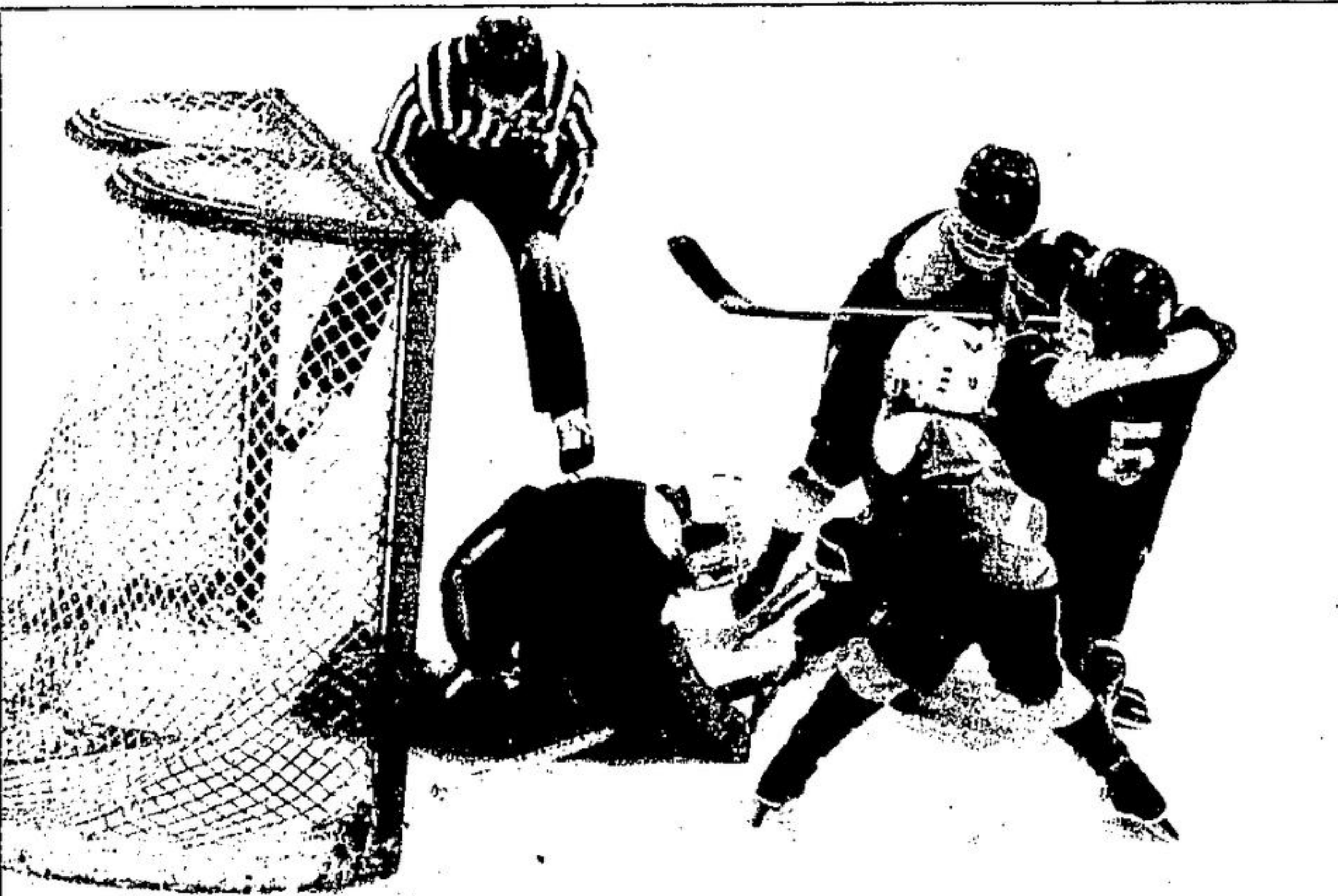
Alton McIsaac Concrete Construction Novices create havoc for Fergus in the fourth game of the best-of-five consolation crown series in Waterloo-Wellington action Saturday at the Community Centre. Acton won the game 4-2, setting the stage for the final game to be played Saturday in Fergus.