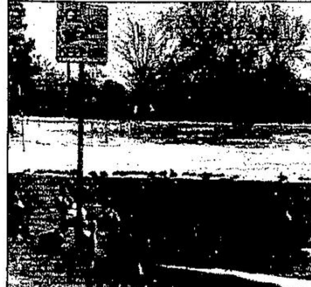
Signs are up around the area of Fairy Lake where the water fowl are wintering, warning the ice is thin. The signs were erected shortly after a boy fell through the ice last month, but since the signs went up another boy has fallen into the chilled water.