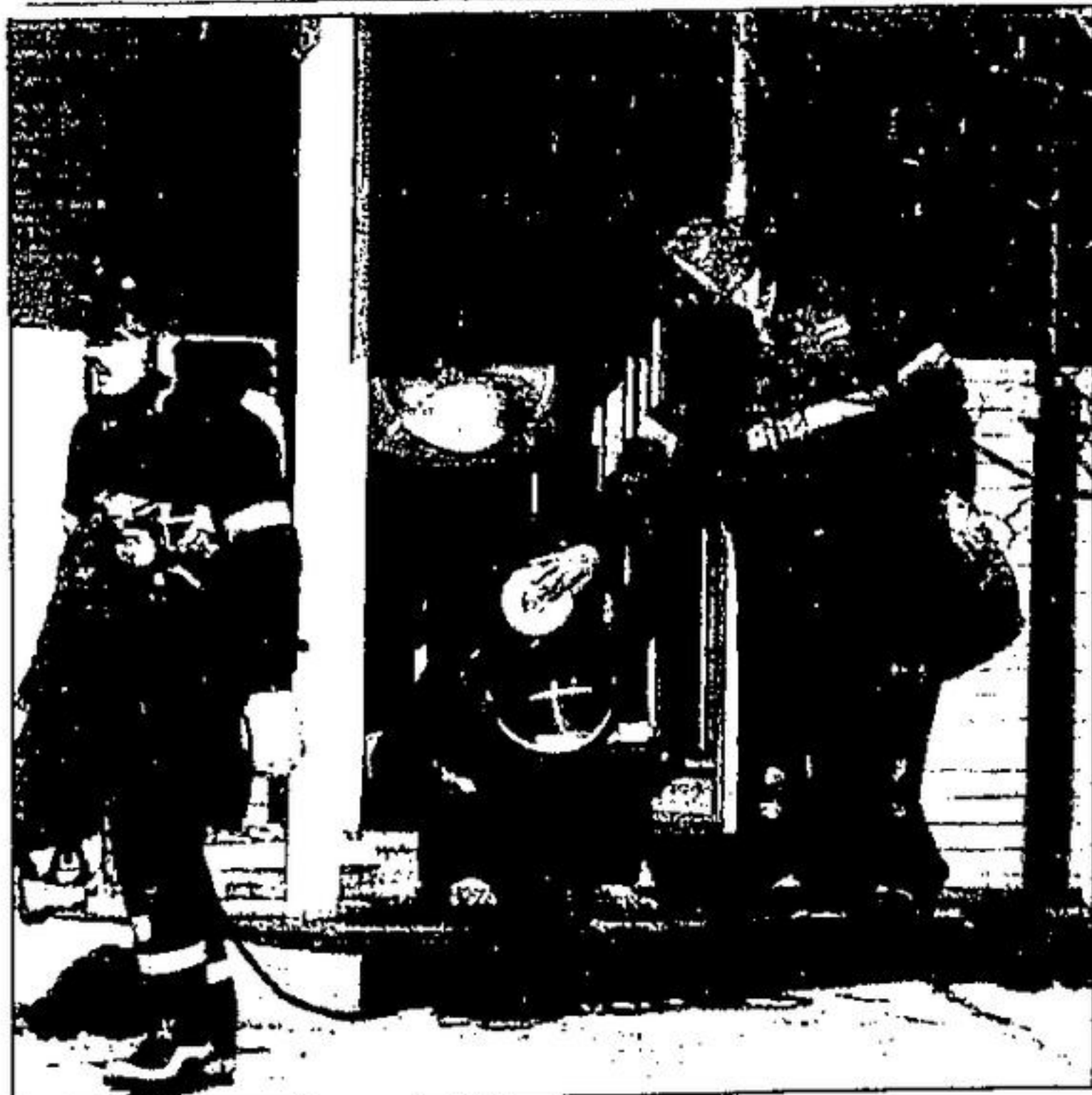
Acton Firefighters had to use air packs when they were inside the burning Cockburn home on Rosemary Rd. Saturday. About $5,000 in damages resulted from the blaze.