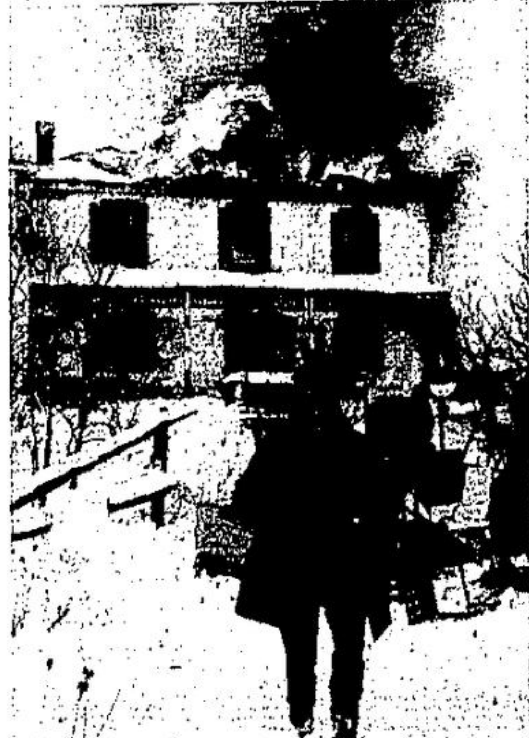
Fire destroyed the Foster home in Nassagaveya in 1970. Very few possessions were saved.