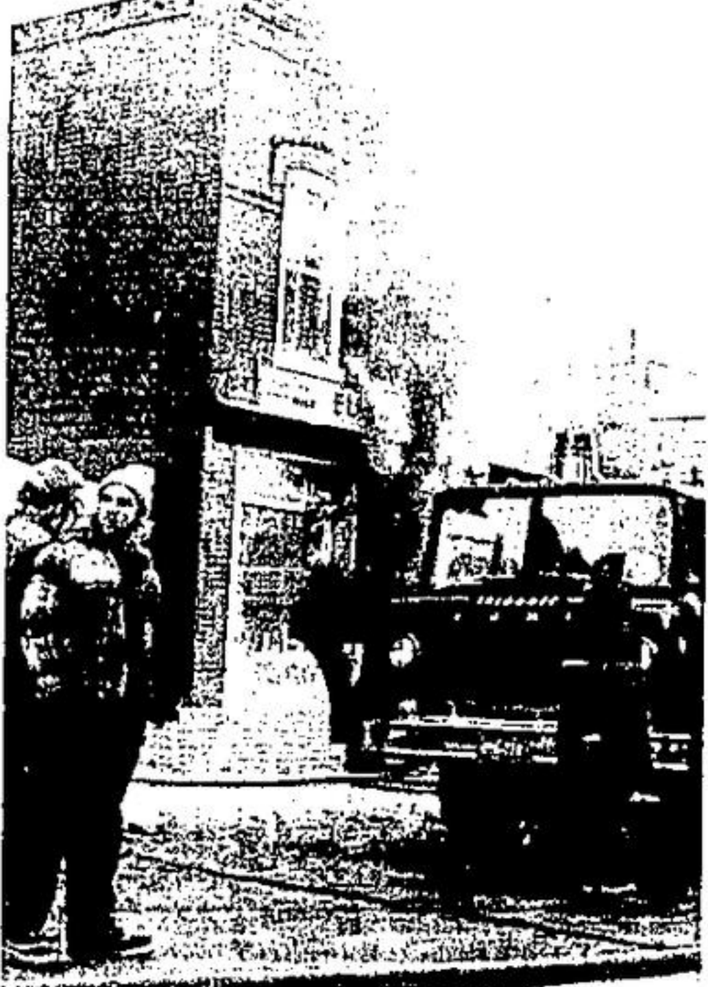
Fire broke out in Eliza Shoes in February, 1978, destroying the entire stock. It was the first of a rash of large fires causing hundreds of thousands of dollars in damages.