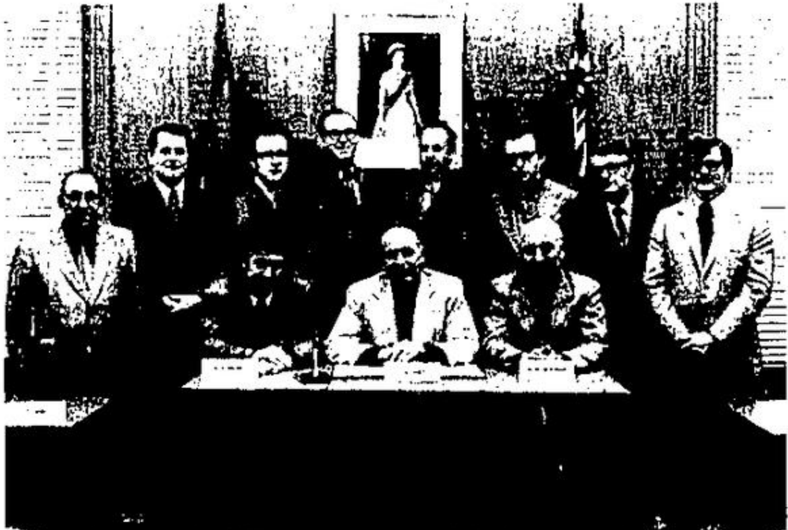
Acton's last council dissolved in 1973 when regional government took over.