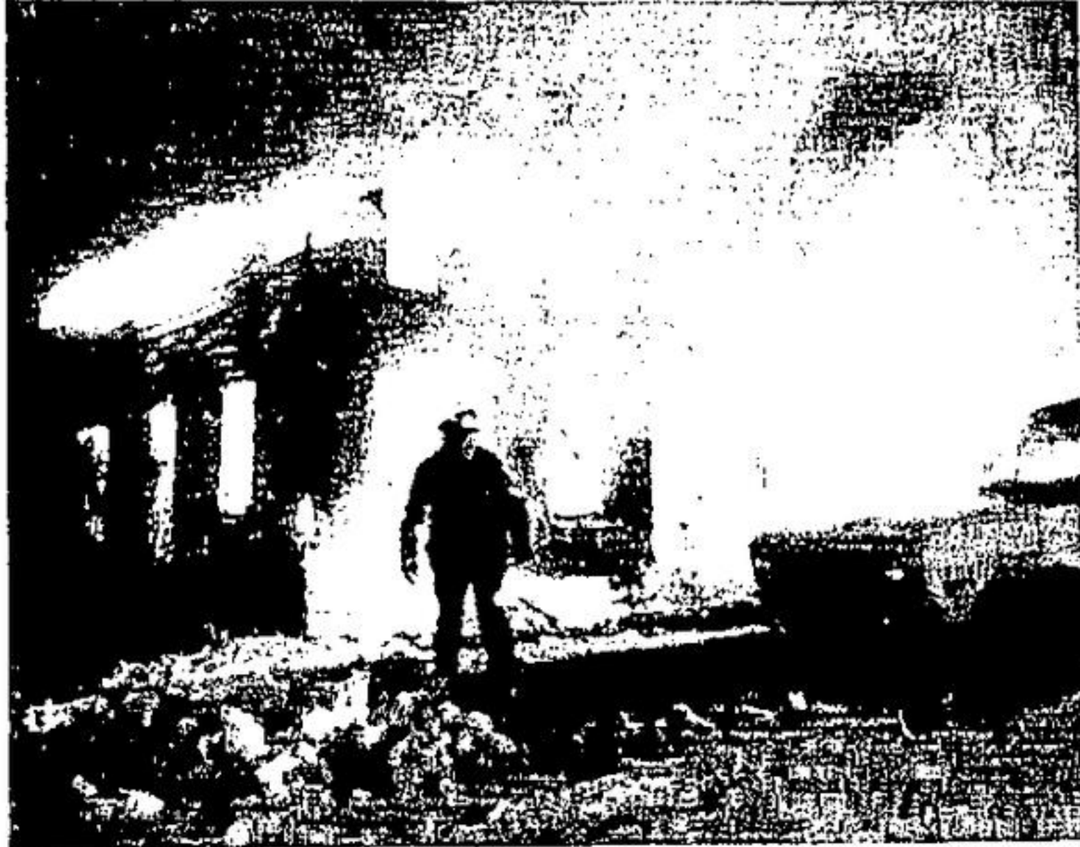
One of Acton's worst fires in the decade claimed two lives in 1979 as the Jones home on Highway 25 burned to the ground.