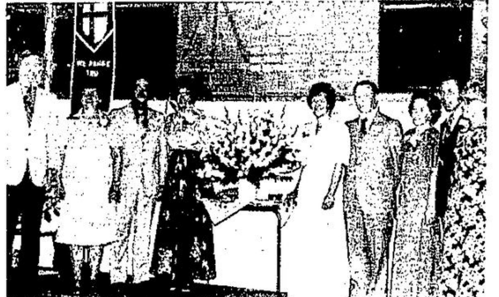
Beth-El Christian Reformed Church celebrated its 25th anniversary in 1978.