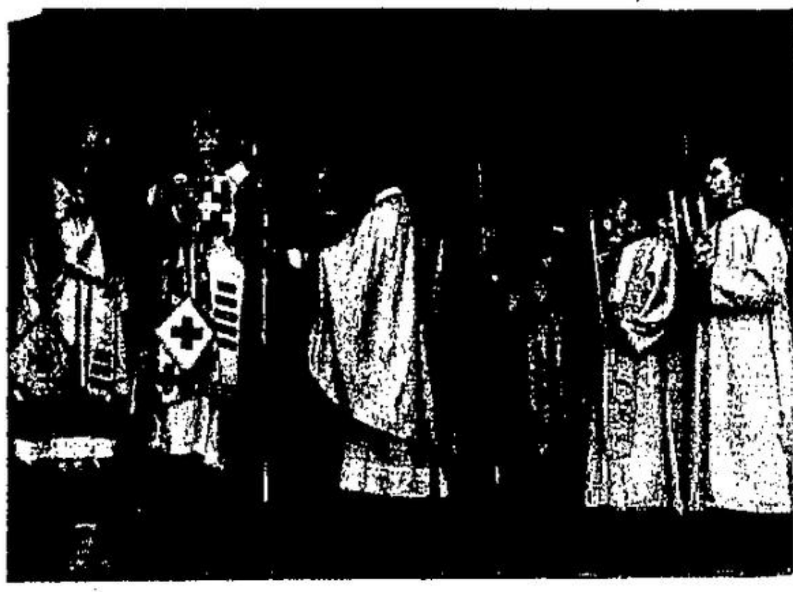
Ukrainian camp on the Fourth Line was honored in 1973 with the visit of Cardinal Slipj.