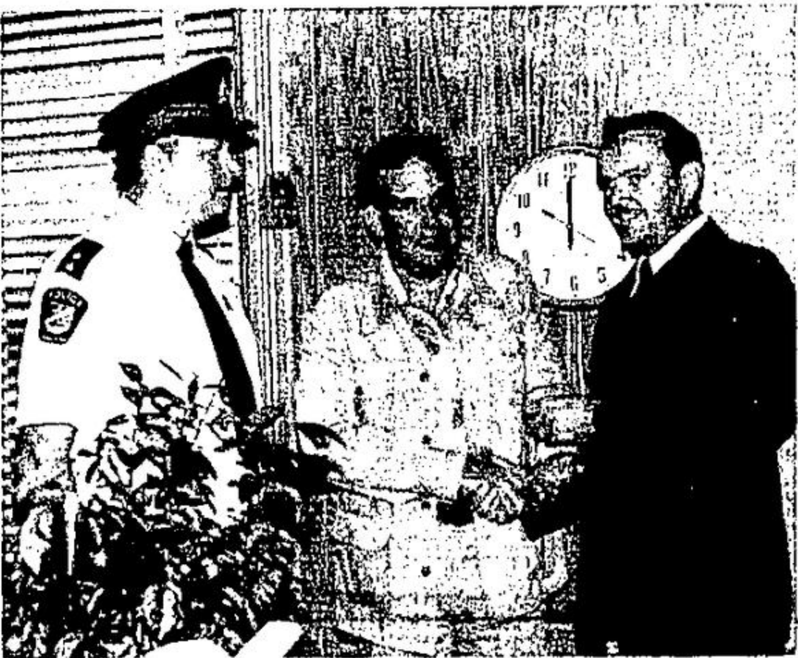
Regional police took over where Acton OPP left off in 1975.