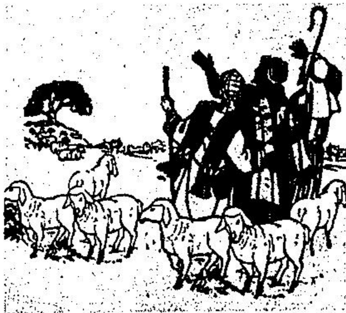
Wise shepherds watched their flocks by night...

To the basic yolk mixture, add 6 tbsp. of crumbled blue cheese, 1/2 cup of softened cream cheese, and finely chopped parsley. Fill egg white halves and garnish with more parsley.