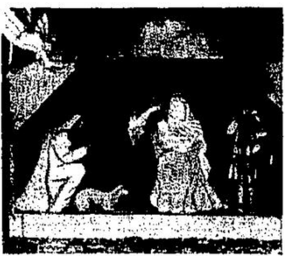
St. John's Anglican Church nativity scene is now gracing the village green to the delight of passers-by.