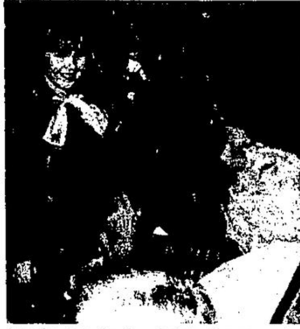
Brownies from the Second Acton Company entertained residents of Jeanette's Home for Senior Citizens last week. The girls sang carols and distributed Christmas gifts.

Assistance to curb these illegal activities will be available from the conservation Officers of the various districts of the Ministry of Natural Resources involved in the Credit River Watershed.