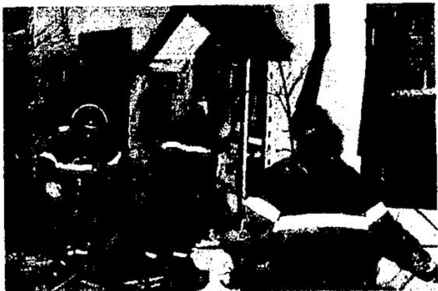
Acton Firefighters were called out Sunday night to a blaze in an abandoned home on Elgin St. Vandals are suspected to have set the home on fire. The home was