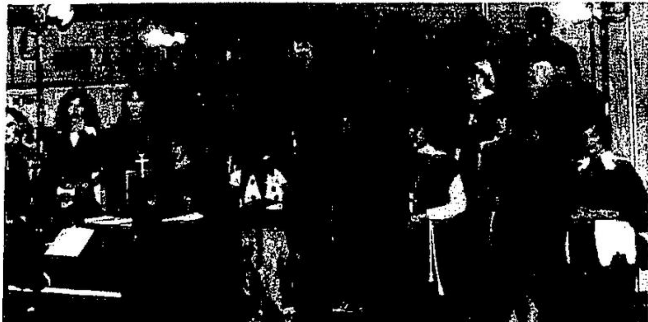
The entire entourage of monks, jesters, peasants and people assemble for old English corals and the Trinity United Church Boar's Head Dinner Sunday night at the Legion.