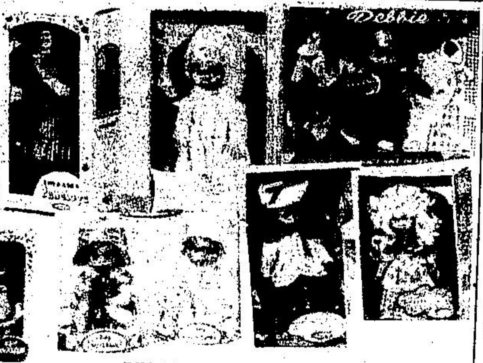
'LIL' AGATHA BABY SWEETUMS PENELOPE - TRUFFLES PILLOW BABY DEBBIE $4.99