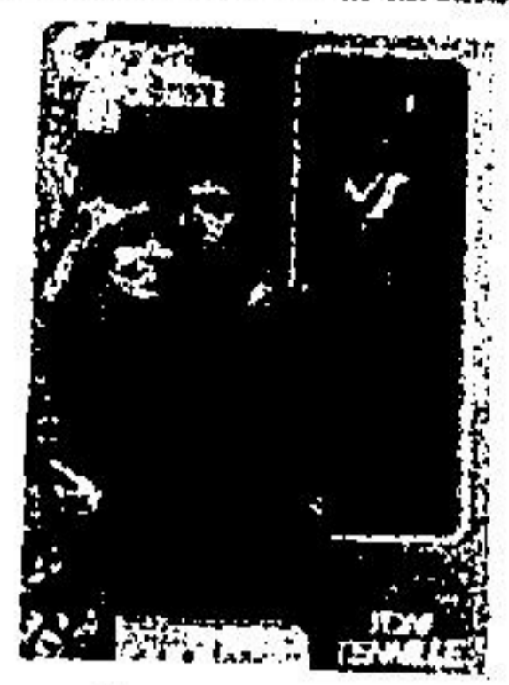
CAPTAIN & TENNILLE DOLLS $4.99