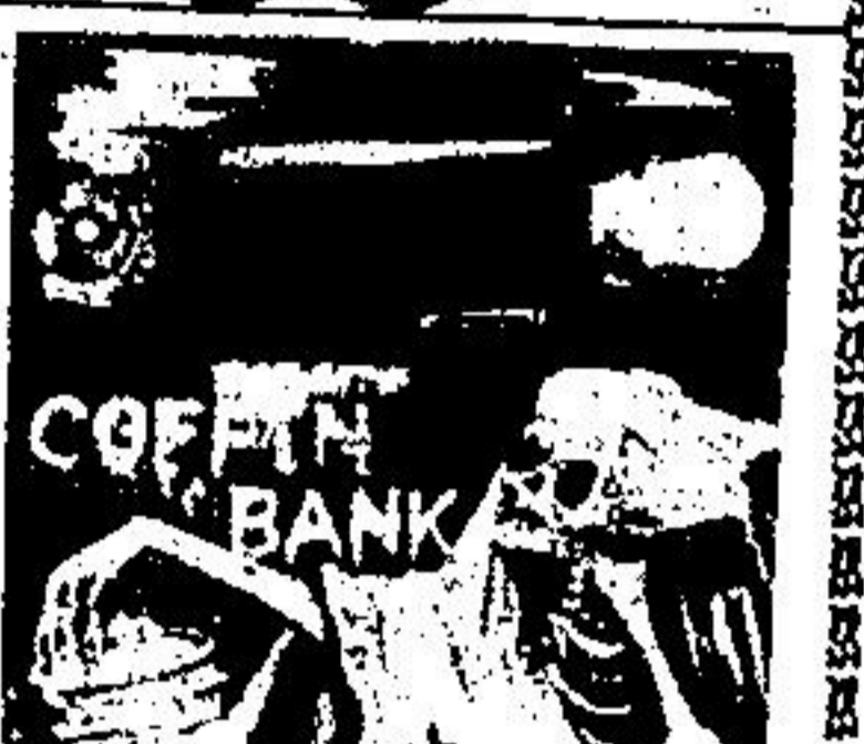
WIND UP COFFIN BANK $1.99