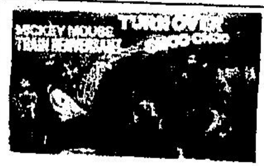
MICKEY MOUSE TURNOVER CHOO CHOO $10.99