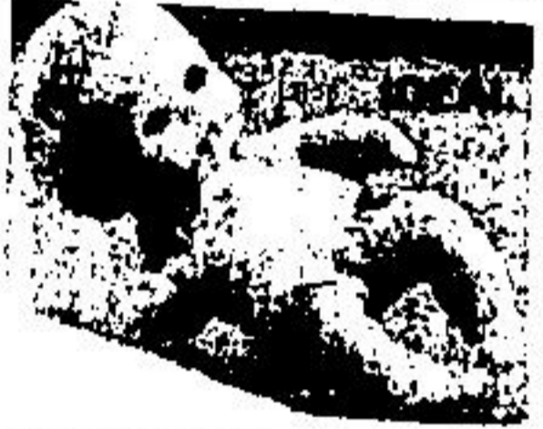
BABY BABY DOLL $4.99

BABY BABY by IDEAL... a handful of love! When she's given her own bottle, it moves in and out so she appears to be drinking! Turn the bottle... her eyes close! Turn it back... they open again! 7" doll.