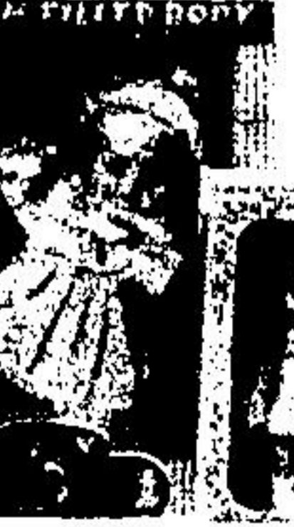
$3.49 $2.49 $6.99