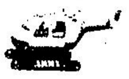
BUDDY L ARMY CHOPPER $2.49