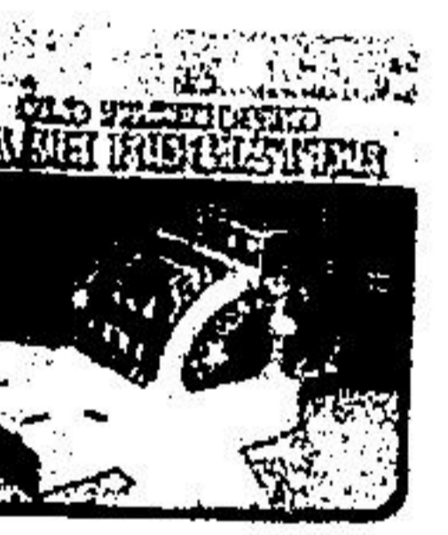
BUDDY L OLD FASHIONED CASH REGISTER $5.99