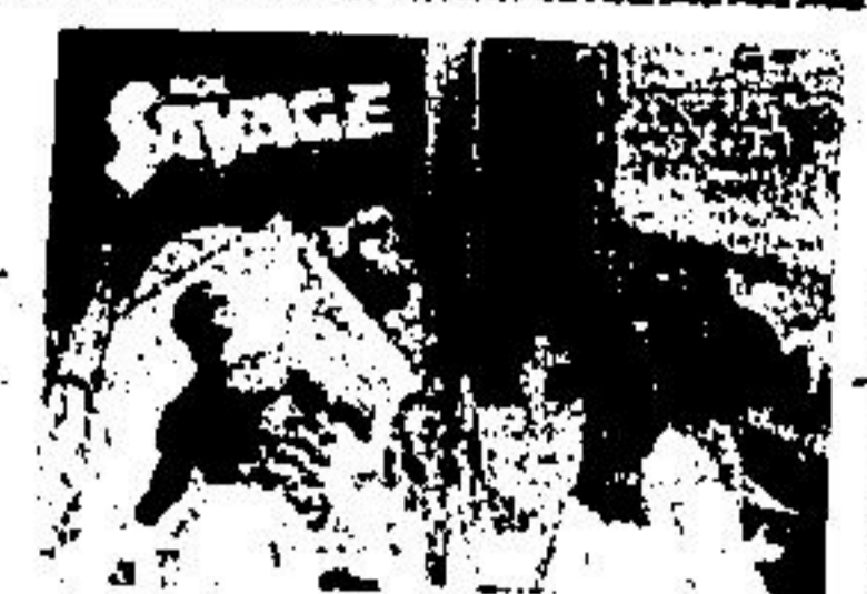
DOC SAVAGE ADVENTURE BOOKS Sugg. Retail $1.75 HARD COVER 99¢