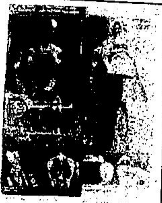
PULSAR DOLL $6.99

ggedy Ann y favourites ive soft bodies 7.99 ea.